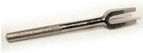
Tie rod end / Ball joint Separator (Different fork sizes)