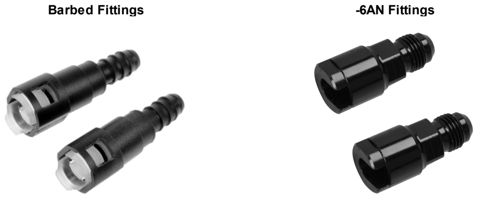
Figure 3 - Sensor Fuel Fitting Adapters

The AEM Flex Fuel Ethanol Content Sensor Kit is available with either barbed or -6AN fitting adapters as shown in Figure 3. Please ensure that these are installed securely and verify the system is completely leak free before proceeding.