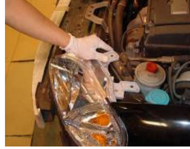
Step 15: Bolt in the headlight.