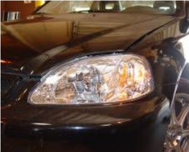
Step 16: Make sure all functions work properly before driving.