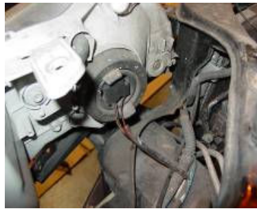
Step 11: Unplug the original headlight wire harness.