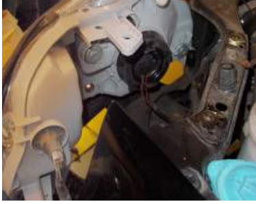
Step 14: Plug in the head light wire harness and twist on the corner light.