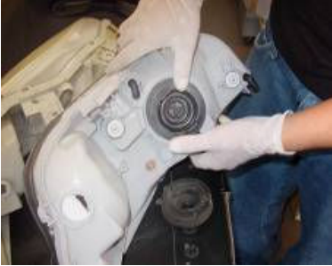
Step 13: Put in the head light bulb and put the rubber seal on the new Anzo headlight.