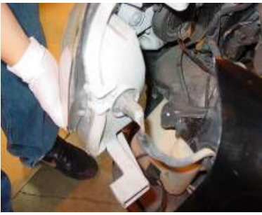
Step 10: Twist off the turn signal from the the headlight.