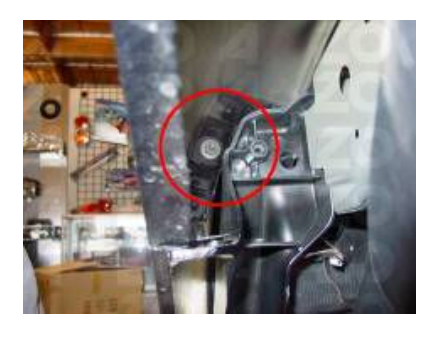
Step 6: Remove the 10mm bolt located inside the fender behind the headlight housing.