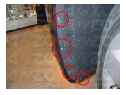
Step 3: Remove the five push pins located in the front tire well.