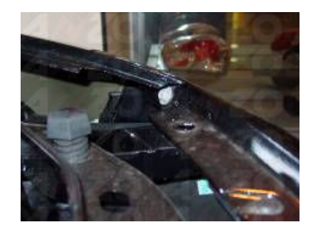
Step 2: Use the 10mm socket to remove the bolt located under the top fender.