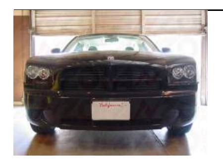
Tools needed: Phillips screwdriver, flat head screwdriver, 10mm socket, 7mm socket, wire splicer, electrical tape

Description: Head Light Part Number: 121217-121218 Application: 2006-2008 Dodge Charger