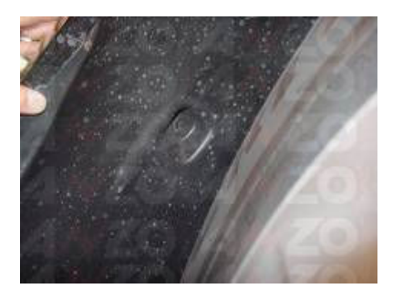
Step 4: Use the flat head screwdriver to remove the push pin located in the front tire well.