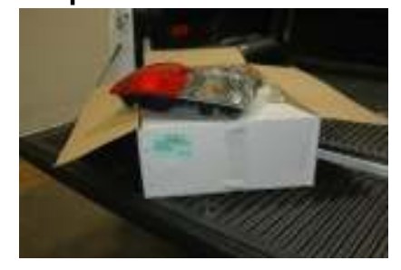
Remove the Anzo tail lights out of its box