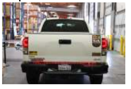
Test all functions before operating the vehicle