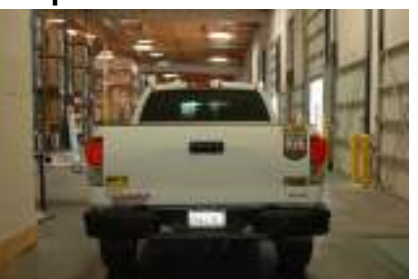
Tools needed: Phillips Screw Driver