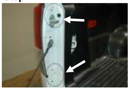
Remove the two phillips screws located directly behind the tail light housing