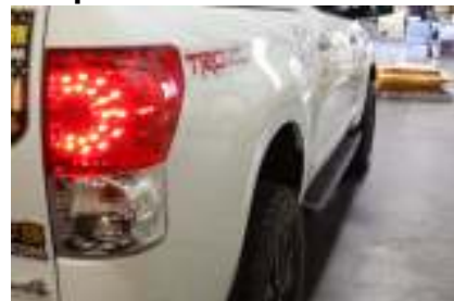
Install the Anzo tail lights by reversir the steps 2 to 4