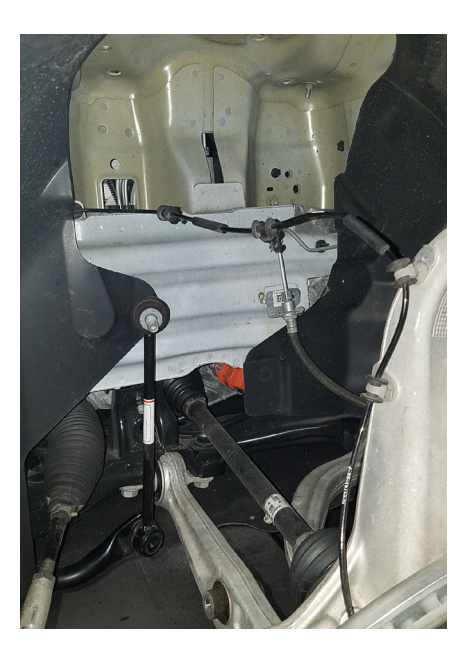
14. Remove the (3) upper shock mount nuts from the upper control arm mount and separate the shock from the upper control arm mount. Do not discard the upper mount nuts.