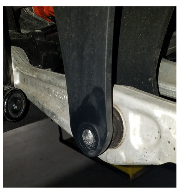
12. Loosen and remove the upper ball joint retaining bolt. Separate the ball joint from the knuckle.