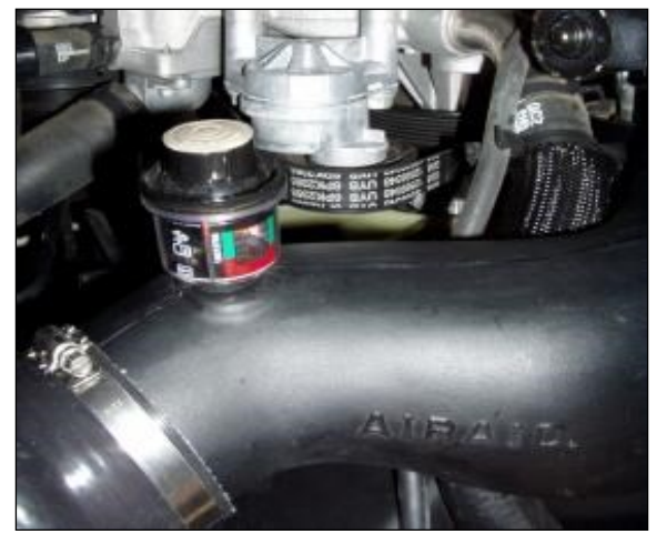
Optional: Installation of Factory Filter Minder in MIT Tube