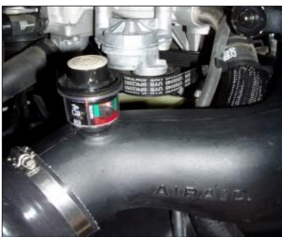
Optional: Installation of Factory Filter Minder in MIT Tube