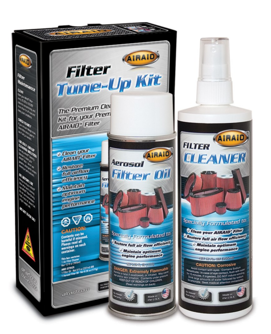
P/N 790-551 Aerosol Spray P/N 790-550 Squeeze Spray