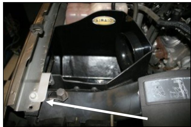
8. Install the CAB assembly into the vehicle where the factory airbox used to be using three 6mm hex bolts (#12) and three flat washers (#11) thru the bottom. Now reinstall the factory fender bolt thru the bracket and into the fender. Adjust the assembly for fit and tighten all bolts and nuts at this time.