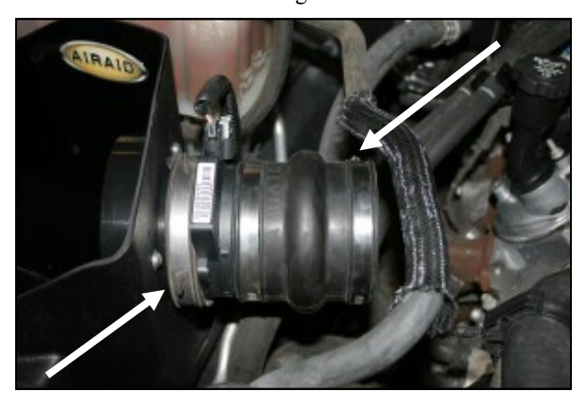
9. Reinstall the MAF sensor and coupler onto the filter adapter and tighten the clamp. Next install the hump hose (#5) onto the MAF using two

#60 hose clamps (#13). Leave these two clamps loose