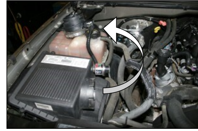
3. Remove the factory intake tube from the vehicle. Next, remove the MAF sensor and coupler from the factory airbox and set them out of the way without disconnecting the wiring harness.