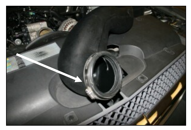
10. Install the provided coupler with clamp (#6) onto the large end of the Airaid Intake tube (#2). Do not tighten the clamp at this time.