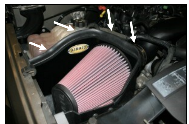
12. Install the provided weather strip (#7) along the top edge of the Airaid Cool Air Dam starting at the right fender working your way around towards the radiator. Install the Airaid Premium Filter (#1) onto the air filter adapter and tighten the hose clamp. Reinstall the factory beauty cover removed in step #1.