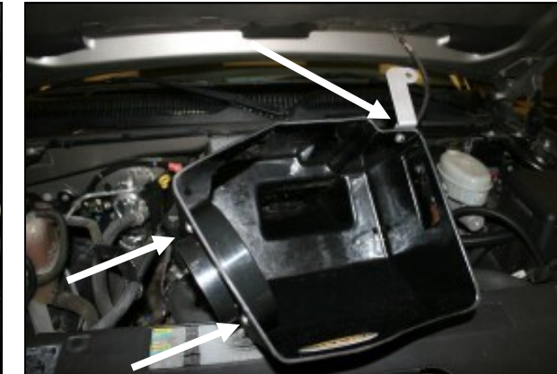
6. Install the filter adapter (#4) into the Cool Air Box (#3) as shown using three 1/4" Button head bolts (#8) and three 1/4" flat washers (#11). Next, fasten the bracket to the front of the CAB as shown using one 1/4-20 hex bolt (#9) two flat washers (#10), and one 1/4" Nylock nut. Refer to the drawing above for reference.