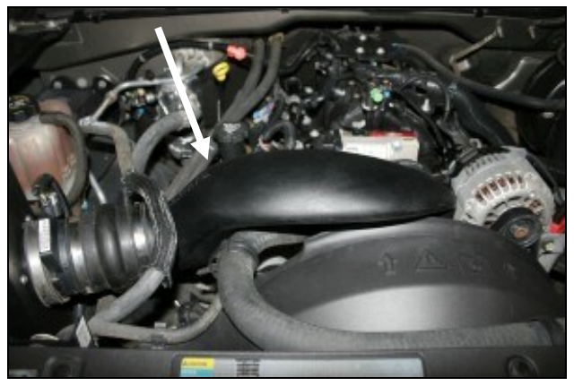
11. Install the small end of the intake tube into the hump hose first and then rotate it slightly to slide the other end onto the throttlebody. Adjust for fit, and then tighten all three hose clamps.