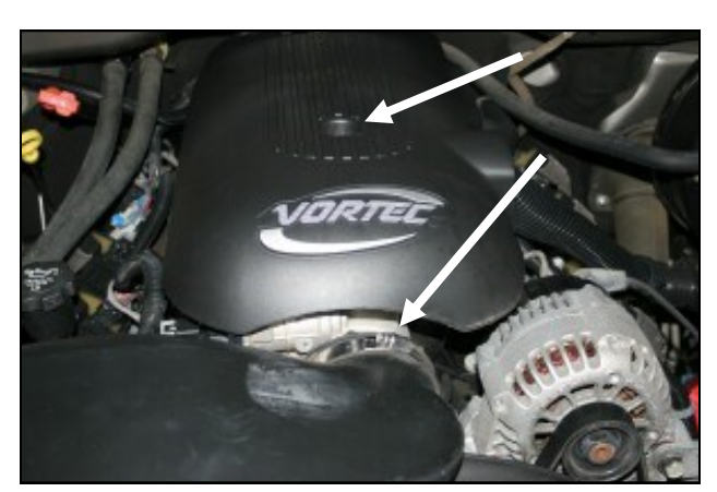
1. <u>Disconnect the negative battery cable.</u> Loosen the bolt that secures the beauty cover to the engine and remove it and the cover from the vehicle. Loosen the hose clamp that secures the factory air intake tube to the throttlebody.