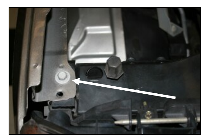
7. Remove the factory bolt that secures the right front fender to the radiator support. It will be reused in step