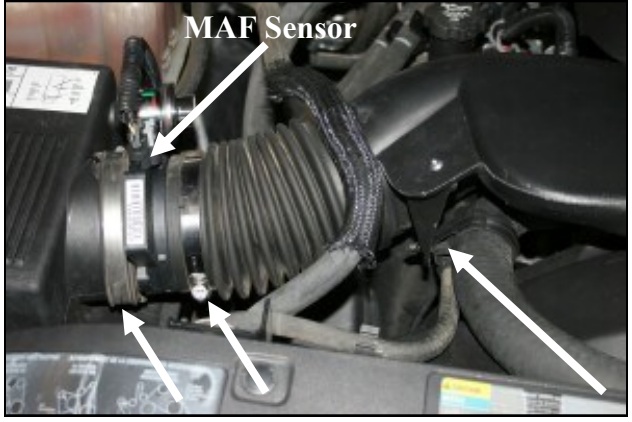
2. Loosen two hose clamps. One on each side of the Mass Air Flow (MAF) sensor. Using a flat blade screwdriver, disconnect the factory intake tube from the plastic clamp on the radiator hose