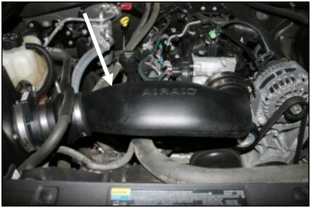
11. Install the small end of the intake tube into the hump hose first and then rotate it slightly to slide the other end into coupler on the throttlebody. Adjust for fit, and then tighten all four hose clamps.