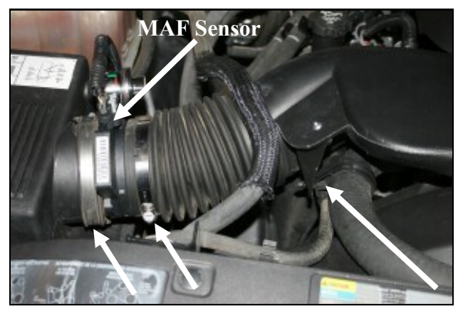
2. Loosen two hose clamps. One on each side of the Mass Air Flow (MAF) sensor. Using a flat blade screwdriver, disconnect the factory intake tube from the plastic clamp on the radiator hose by prying them apart.