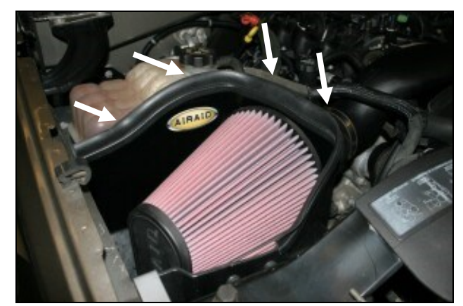
12. Install the provided weather strip (#7) along the top edge of the Airaid Cool Air Dam starting at the right fender working your way around towards the radiator. Install the Airaid Premium Filter (#1) onto the air filter adapter and tighten the hose clamp. Reinstall the factory beauty cover removed in step #1.