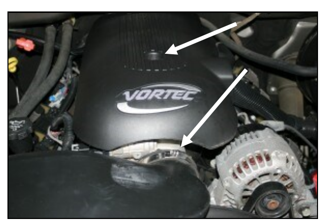
1. <u>Disconnect the negative battery cable.</u> Loosen the bolt that secures the beauty cover to the engine and remove it and the cover from the vehicle. Loosen the hose clamp that secures the factory air intake tube to the throttlebody.