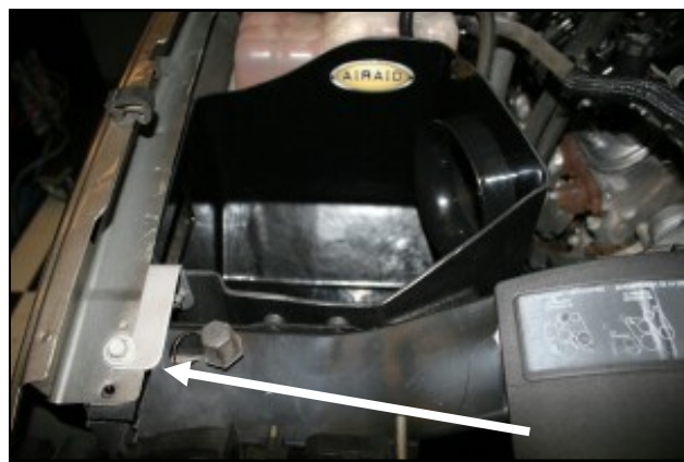
8. Install the CAB assembly into the vehicle where the factory airbox used to be using three 6mm hex bolts (#12) and three flat washers (#11) thru the bottom. Now reinstall the factory fender bolt thru the bracket and into the fender. Adjust the assembly for fit and tighten all bolts and nuts at this time.