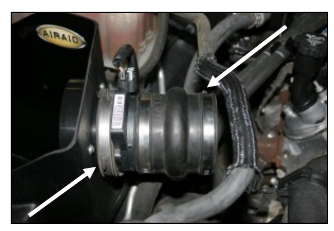
9. Reinstall the MAF sensor and coupler onto the filter adapter and tighten the clamp. Next install the hump hose (#5) onto the MAF using two #60 hose clamps (#13). Leave these two clamps loose for now.