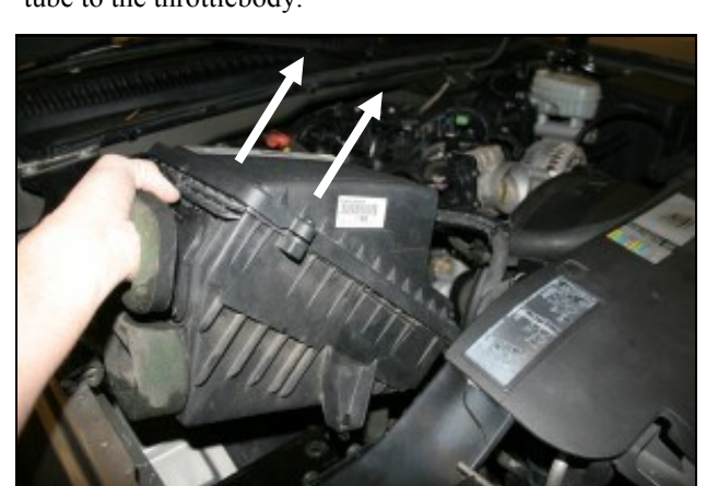
4. Rock the factory air box back and forth and then lift straight up remove it from the vehicle. There are only grommets holding it in place, no bolts.