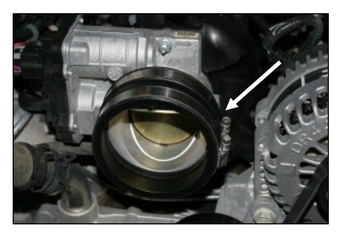
10. Install the provided coupler (#6) with two #64 hose clamps (#14) onto the throttle body. Do not tighten the clamps at this time.