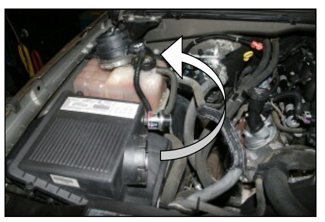
3. Remove the factory intake tube from the vehicle. Next, remove the MAF sensor and coupler from the factory airbox and set them out of the way without disconnecting the wiring harness.