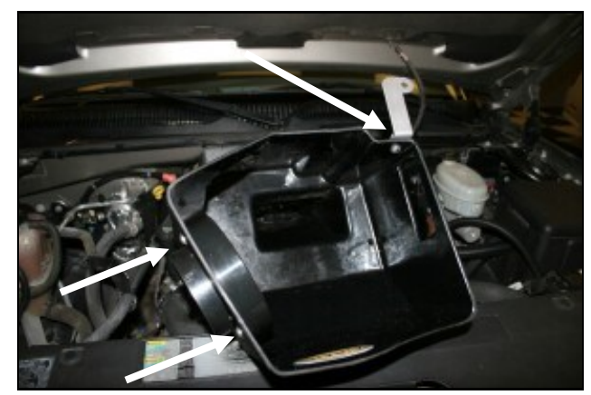
6. Install the filter adapter (#4) into the Cool Air Box (#3) as shown using three 1/4" Button head bolts (#8) and three 1/4" flat washers (#11). Next, fasten the bracket (#15) to the front of the CAB as shown using one 1/4-20 hex bolt (#9) two flat washers (#10), and one 1/4" Nylock nut. Refer to the drawing above for reference.