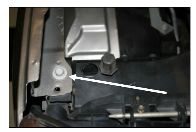
7. Remove the factory bolt that secures the right front fender to the radiator support. It will be reused in step #8