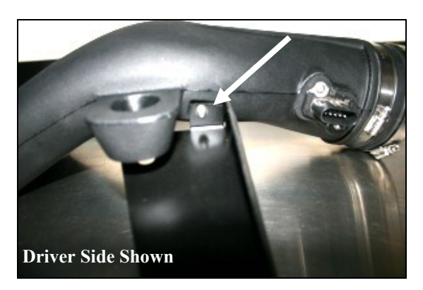
10. Attach the two air dams (#4 driver side & #5 passenger side) onto the Airaid Intake Tube using one 8-32x1/4" button head bolt (#8) and #8 flat washer (#9) on each side. Leave the bolts slightly loose for now to allow for adjustment.