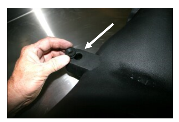
8. Install the two factory grommets that were removed in step #4, into the Airaid Intake Tube as shown