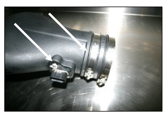
9. Reinstall the Mass Air Flow sensor removed in step #5, into the Airaid Intake Tube using two 8-32x3/8" button head bolts (#7).