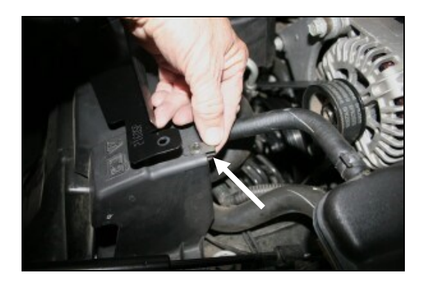
13. Slide one clip nut (#10) over the outside end of the plastic radiator cover and align it with the hole in the air dam. Install one rubber washer (#11) over the threads of the clip nut, and then align the air dam hole over the washer. Add one more rubber washer, one #8 flat washer (#9), and one M4 Pan Head Screw (#8) to secure the air dam. Repeat this step on the passenger side. Refer to the line drawing on page one.