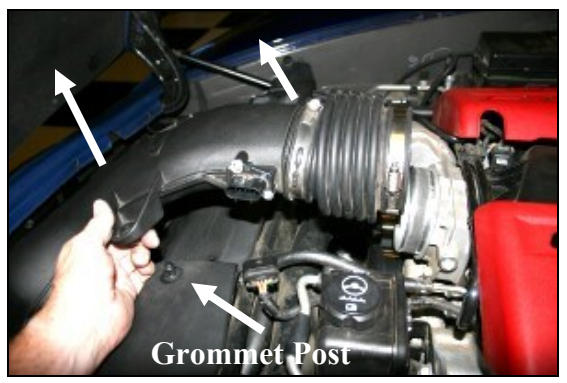
3. Lift up on the factory intake tube assembly to disengage the grommets from the two grommet posts and throttle body. Remove the assembly from the vehicle.