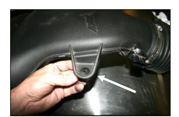
4. Remove the two factory grommets from the factory intake tube and set them aside for reuse in step #8.