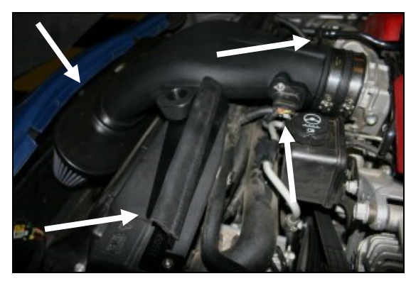
15. Slide the Airaid Premium Filter up onto the end of the intake tube and tighten the clamp. Reconnect the MAF sensor wiring harness and replace the grey security clip. Reconnect the factory breather hose to the breather fitting. Install the weather strip (#6) onto the top of the air dams as shown.