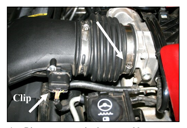
1. <u>Disconnect negative battery cable.</u> Remove the grey security clip on the bottom of the Mass Air Flow sensor wiring connector. Next squeeze the tab on the bottom of the connector, and disconnect the wiring harness from the sensor. Now loosen the hose clamp holding the tube to the throttle body.