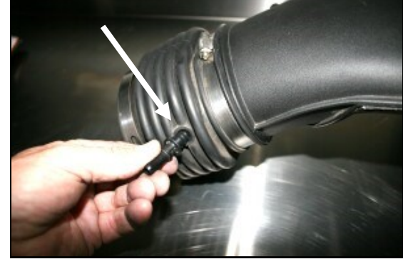
6. Remove the factory breather fitting from the factory intake tube and save for reinstallation in step #7.