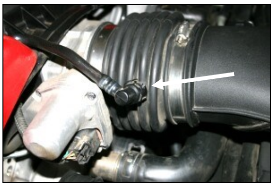
2. Push the tab on the top of the crankcase breather connector, and disconnect the breather hose from the factory intake tube breather fitting.