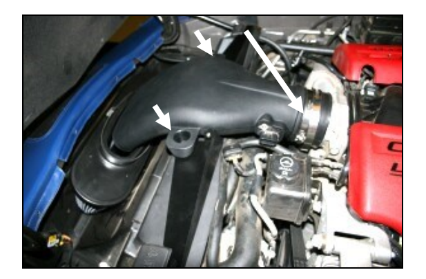
12. Install the Airaid Intake Tube assembly onto the throttle body first, and then align the grommets and the holes in the air dams over the factory grommet posts on top of the radiator shroud. Push down to seat the grommets on the posts. Now tighten the hose clamp on the throttle body.