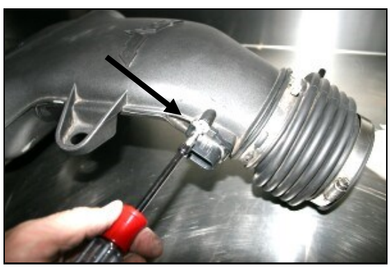
5. Using an IPR20 Torx Plus Security Bit (Or Equivalent) remove the two factory screws that hold the MAF sensor into the factory intake tube. Remove the MAF sensor for reinstallation in step #9.