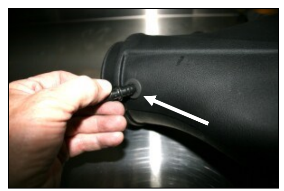
7. Install the provided grommet (#13) into the hole in the Airaid Intake Tube (#2). Next install the factory plastic breather fitting removed in step #6 into the grommet.