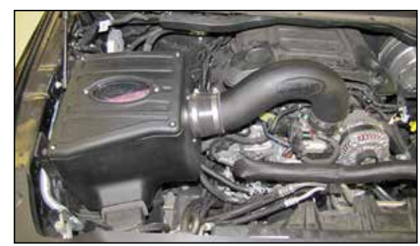
17. Double check your work! Make sure there is no foreign material in the intake path. Make sure all clamps, hoses, bolts, and screws are tight. Double check the hood clearance!