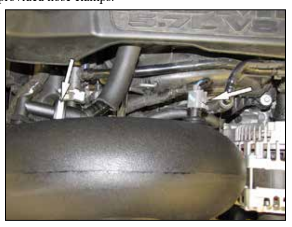
14. Connect the factory crank case vent hose to the quick disconnect fitting installed into the AIRAID® intake tube. Reconnect the inlet air temperature sensor electrical connection.