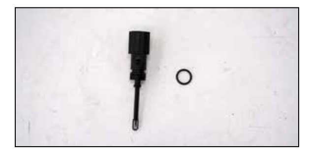
11. Remove the inlet temperature sensor from the factory intake tube and then remove the O-ring from the sensor.