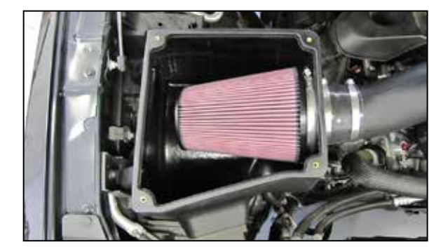
15. Install the AIRAID® air filter onto the filter adapter and secure with the provided hose clamp.