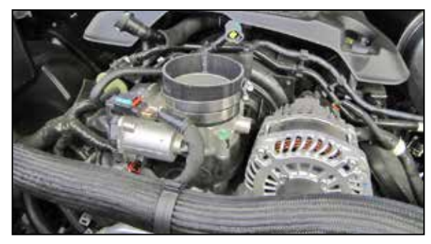
8. Install the provided coupler hose (KITCOUPLER09) onto the throttle body and secure with the provided hose clamp.