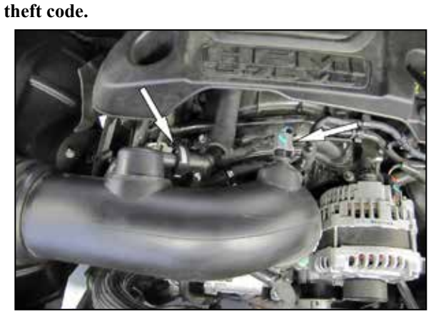
2. Disconnect the inlet air temperature sensor electrical connection and crank case vent quick disconnect fitting.

NOTE: Disconnecting the negative battery cable erases pre-programmed electronic memories. Write down all memory settings before disconnecting the negative battery cable. Some radios will require an anti-theft code to be entered after the battery is reconnected. The anti-theft code is typically supplied with your owner's manual. In the event your vehicles anti-theft code cannot be recovered, contact an authorized dealership to obtain your vehicles anti-