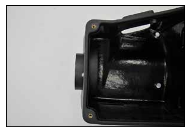
5. Install the filter adapter into the AIRAID® air filter housing and secure with the hardware provided.

NOTE: AIRAID recommends that customers do not discard factory air intake.