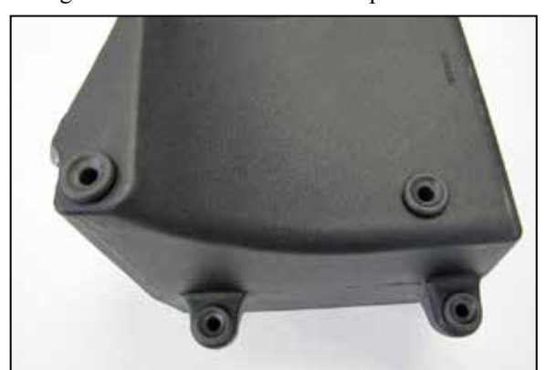
6. Remove the mounting grommets from the factory air filter housing and install them into the AIRAID® filter housing as shown.