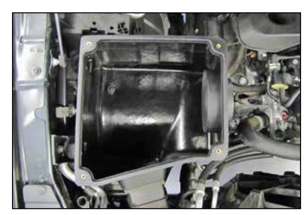
7. Set the AIRAID® air filter housing into the vehicle so that the mounting grommets engage onto the mounting posts.