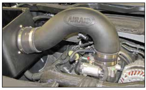
13. Install the AIRAID® intake tube onto the filter adapter and then into the coupler at the throttle body, adjust the tube for best fit and then secure with the provided hose clamps.