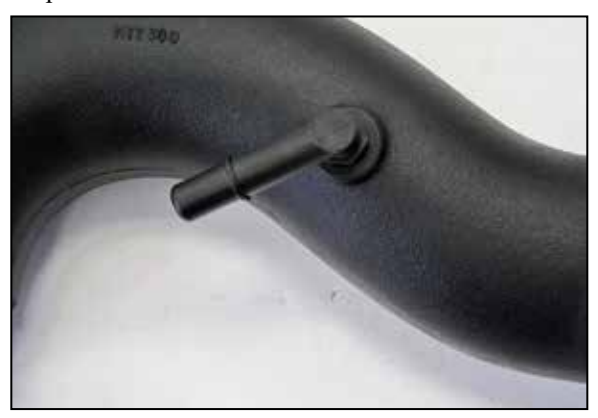
9. Install the provided quick disconnect fitting into the AIRAID® intake tube as shown.

NOTE: Plastic NPT fittings are easy to cross thread. Install the vent fitting "hand" tight, then turn it two complete turns with a wrench.