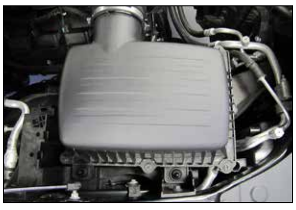
4. Pull up the factory air filter assembly to dislodge it from the mounting posts and then remove the complete intake assembly from the vehicle.

NOTE: AIRAID recommends that customers do not discard factory air intake.