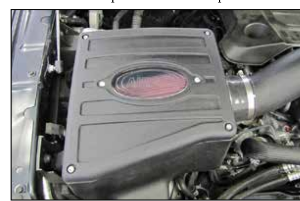
16. Install the AIRAID® window into the air filter housing lid and then install the lid onto the air filter housing and secure with the provided hardware.