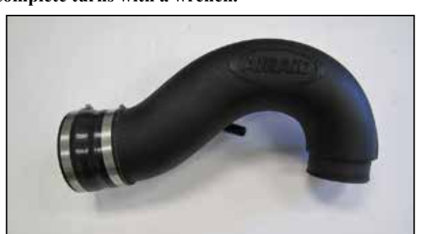
10. Install the provided coupler (KITRDCR30) onto the AIRAID® intake tube and secure with the provided hose clamp.

NOTE: Plastic NPT fittings are easy to cross thread. Install the vent fitting "hand" tight, then turn it two complete turns with a wrench.