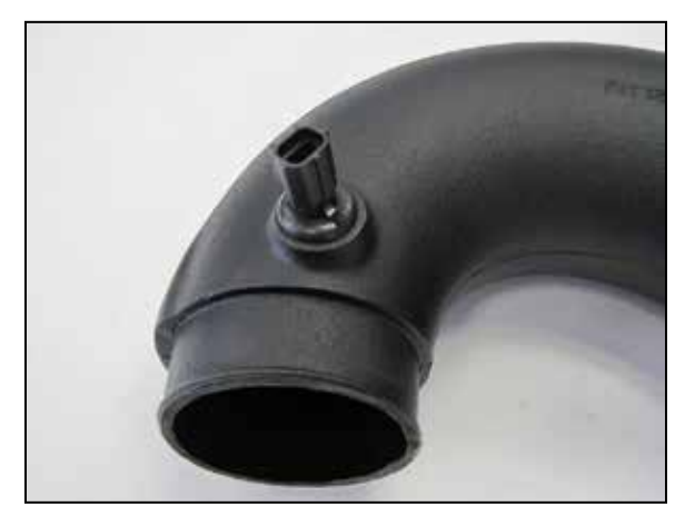
12. Install the inlet air temperature sensor into the AIRAID® intake tube using the provided grommet.