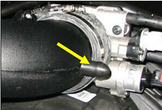
16. 2004-05 Models Only: Slide the provided rubber cap over the nipple at the throttle body end of the Airaid tube.