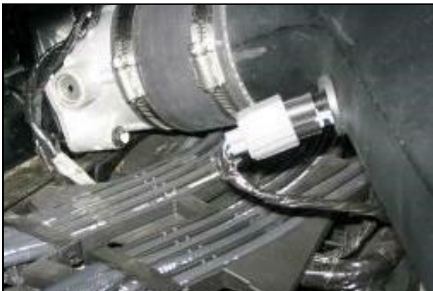
14. Re-connect air temperature sensor connector to the sensor in the Airaid tube.