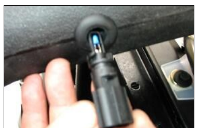
9. 2003-2005 Models Only: Install rubber grommet w/thru hole and insert the factory air temperature sensor into the grommet.