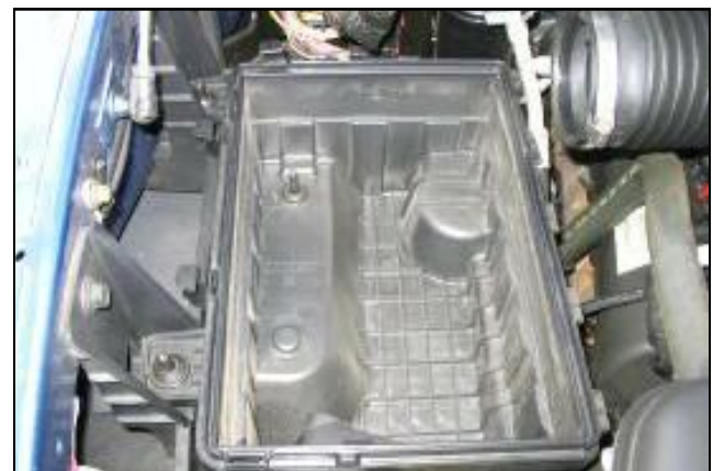
3. Unsnap and remove the factory air box lid, tube, & factory air filter.