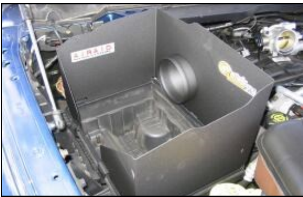
10. Position the Airaid Cool Air Dam in place of the original air box lid. Snap in place.