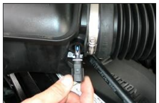
6. 2003-05 Models Only: Disconnect air temperature sensor wire on back of factory throttle body air chamber and remove sensor. Retain sensor for later use with the Airaid Intake System.