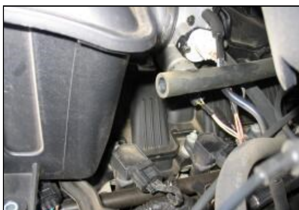
5. 2002 & 2003 Models Only: Disconnect the crankcase vent hose on the back of the factory throttle body air chamber.