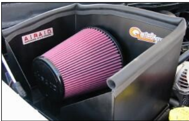
11. Mount the Airaid Premium filter inside the Cool Air Dam & secure with hose clamp provided. In addition, install the weather strip hood seal on the Cool Air Dam. (Hint: begin in a corner and work it on toward the ends)