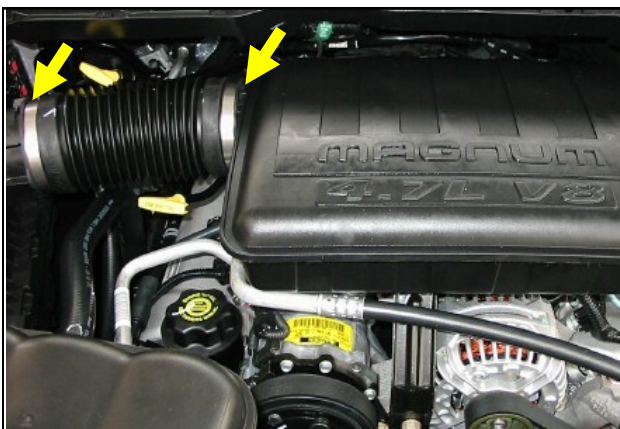
1. Disconnect The Negative Battery Terminal! Loosen the two hose clamps on the factory air tube.

Full color instructions can be viewed on our web site at Airaid.com . Use the Product Search function to find your part number, and click View Details .