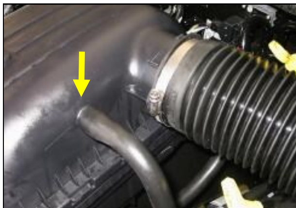
2. 2004-05 Models Only: Disconnect the factory breather hose from the factory air box lid.