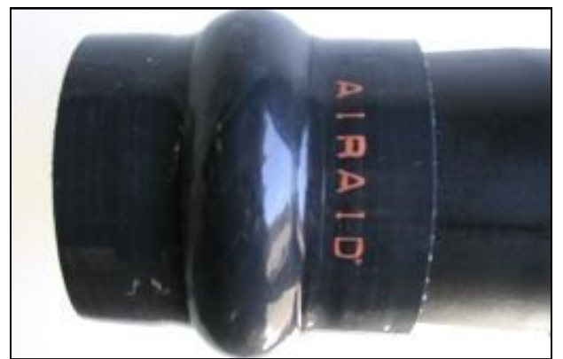
12. Install urethane hump hose onto the Airaid tube and secure using a # 60 hose clamp provided.