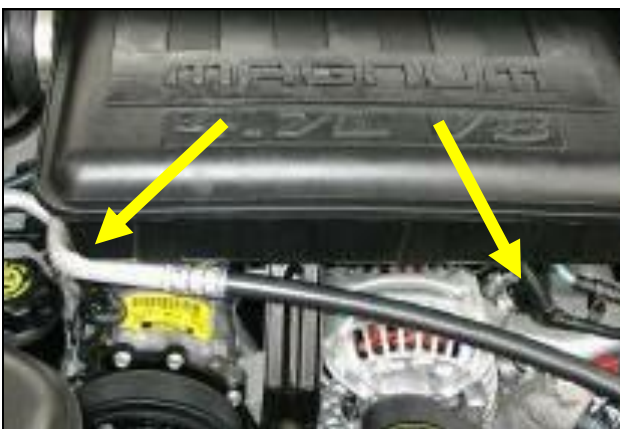
4. Loosen and remove the two 10mm bolts holding on the factory throttle body air chamber intake assembly.