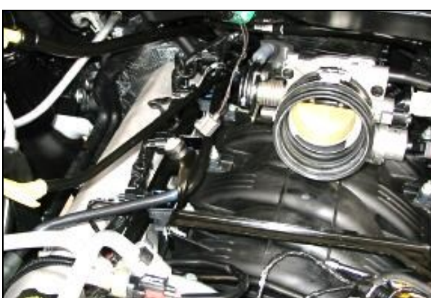
7. Unsnap the factory intake assembly from front of bracket and remove assembly from vehicle. (Note: leave the factory coupler on the throttle body)