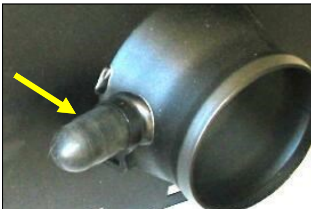
17. 2002 & 2003 Models Only: Slip the black rubber cap over the nipple on the Cool Air Dam and secure using the #19 Speed clamp provided.