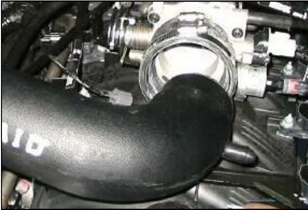
13. Position Airaid tube into place by connecting hump hose to Airaid Cool Air Dam and connect the other end of the tube to the factory throttle body coupler. Utilize the #60 hose clamps on the hump hose and #56 hose clamp on the factory coupler.