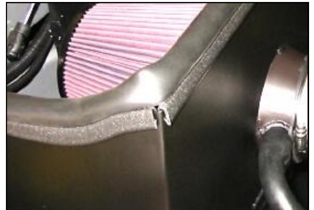
18. 2004-05 Models Only: Connect the factory breather hose to the Airaid Cool Air Dam & secure using the #24 Speed clamp provided.