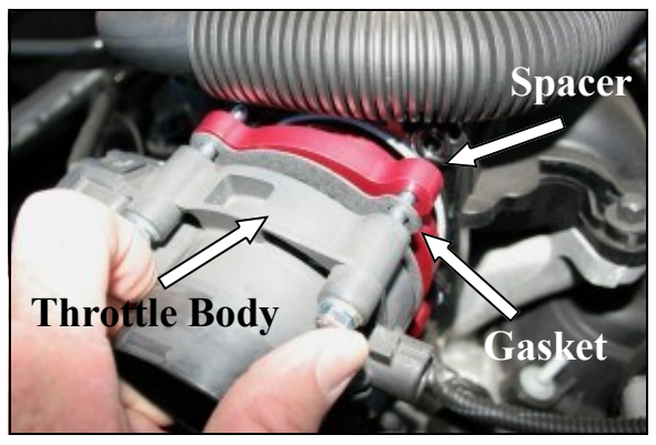
3. Install the Poweraid Spacer and the fiber gasket between the intake manifold, and the throttle body, as shown. Tighten all 4 throttle body bolts evenly, to the manufacturer's specifications. Do Not Over Tighten The Bolts!