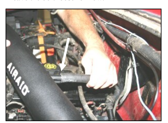
21. Re-connect the breather hose to the Airaid Intake Tube.