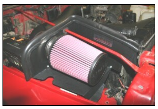
22. Install the Airaid Premium Filter (#1) onto the CAD tube and tighten the hose clamp. Next, install the weather strip onto the top of the CAD as shown, starting at the fender, working your way towards the radiator.