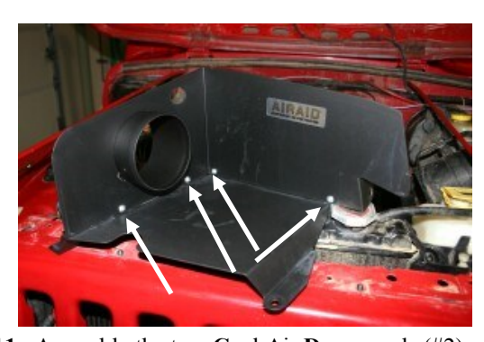
11. Assemble the two Cool Air Dam panels (#2) & (#3) using the four 6-32 screws (#8), #6 flat washers (#9), and nuts (#10), as shown.