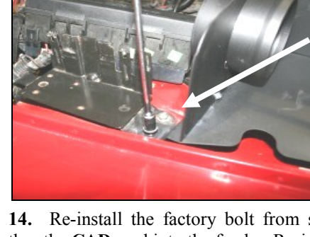
14. Re-install the factory bolt from step # 8 thru the CAD , and into the fender. Re-install the fuse box on the factory mount.