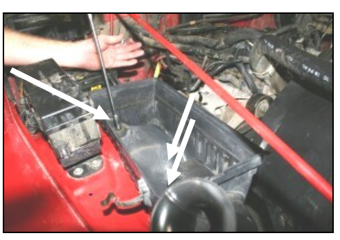
7. Remove three bolts from inside the lower air cleaner box and remove it from the vehicle.