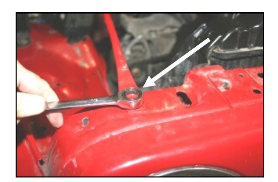
10. Remove and save the bolt from the passenger side radiator support brace. It will be reused in step #13.