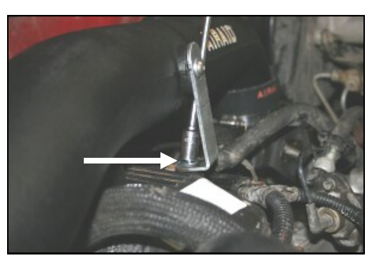
20. Install the 6mm bolt (#15), and 1/4" flat washer (#12), thru the L-bracket, and into the valve cover, adjust for fit, and then tighten all hose clamps, and bolts.