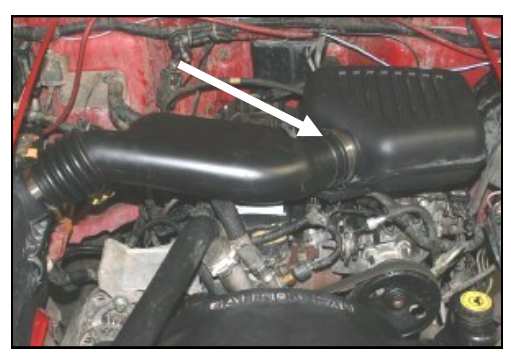
1. <u>Disconnect the negative battery cable.</u> Loosen the hose clamp that holds the factory intake tube to the resonator.