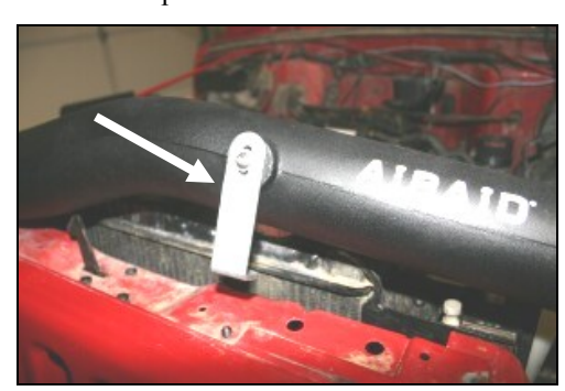
18. Install the L-bracket (#18), onto the Airaid Intake Tube (#4), using one 1/4" button head bolt (#11), and flat washer (#12). Leave the bolt loose for now.