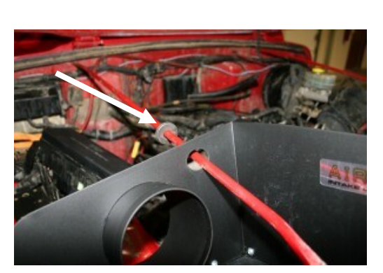
12. Slide the rubber grommet (#19) over the radiator support, followed by the assembled CAD. Use caution not to scratch the paint on the support rod.