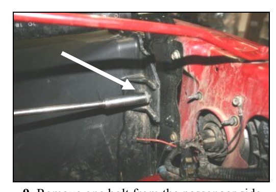
9. Remove one bolt from the passenger side radiator fan shroud and save it for step #15.