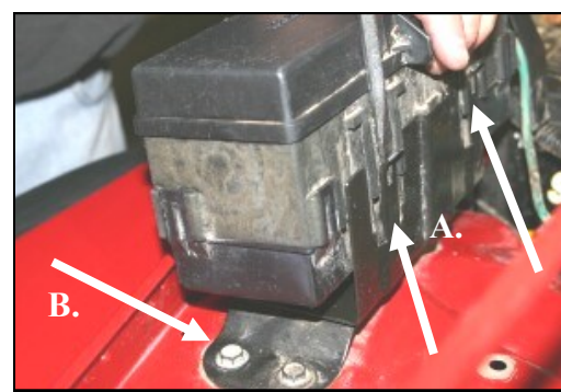
8. A.) On the right fender, pry two tabs away from the fuse box, lift it up and set it off to the side. B.) Next, remove and save the outside bolt from the fuse box mount. It will be re-used in step #14.