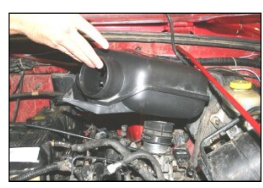
6. Remove the resonator from the vehicle.