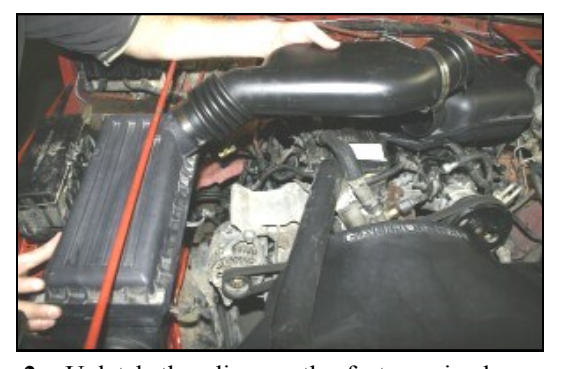
2. Unlatch the clips on the factory air cleaner lid, next remove the lid, and tube as an assembly.