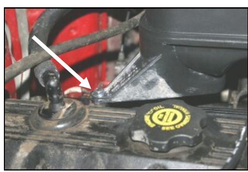
5. Remove the bolt that holds the resonator to the valve cover.