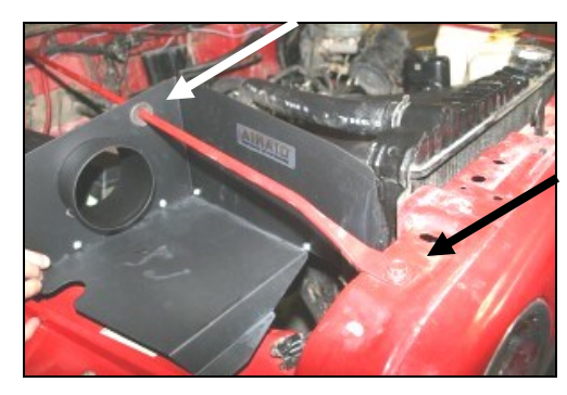
13. Align the CAD over the mounting holes, and re-install the factory bolt from step #10 in the radiator support. Slide the grommet forward into the hole in the CAD as shown.