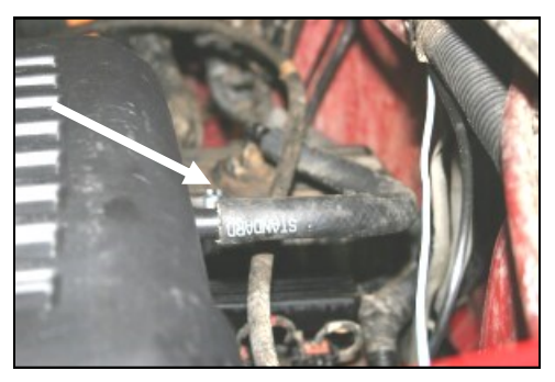
4. Disconnect the breather hose from the resonator.