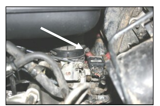
3. Loosen the clamp that holds the resonator to the throttle body.