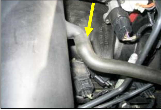
10. Connect the factory breather hose to the Modular Intake Tube & secure hose with the #16 black speed clamp provided.