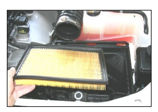
4. Remove the factory air filter from the bottom of the airbox.