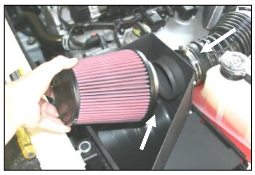
11. Slide the Airaid Premium Filter (#1) onto the Quick Fit panel tube, and tighten the hose clamp. Install the factory intake tube onto the opposite end of the Quick Fit panel tube, and tighten the hose clamp. Tighten the speed clamps on the breather hose, and the 1/2" rubber elbow.