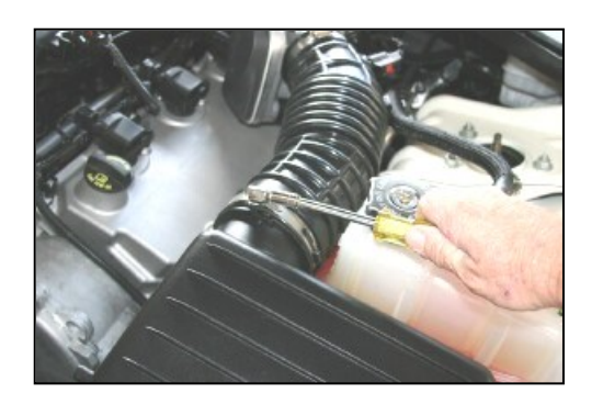
2. Loosen the hose clamp on the factory intake tube, located at the air box lid.