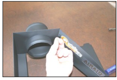
5. Assemble the Quick Fit panels (#2, #3) using four 6-32x 5/16" screws (#5), #6 flat washers (#6), and 6-32 keps nuts (#7).