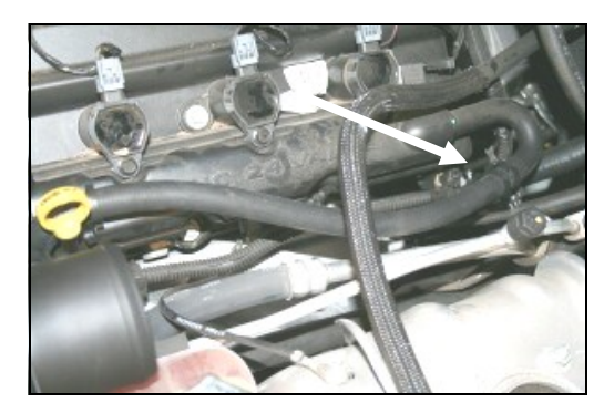
10. For 2.7L Engines : After installing the Quick Fit Panels, ( Refer to step #7 ), connect the breather hose to the factory elbow at the back of the valve cover using one #16 speed clamp. (Factory intake tube removed for instruction purposes).