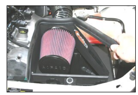
12. Install the weather strip (#4) on the top of the Quick Fit panels. (Hint: Start at one end and work all the way to the other end).