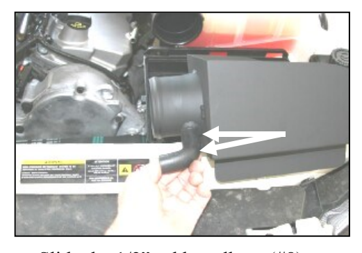
6. Slide the 1/2" rubber elbow (#8) onto the breather fitting on the side of the Quick Fit panels. Install 2 #18speed clamps (#9), one over each end of the elbow, (Do not tighten the clamps at this time.)