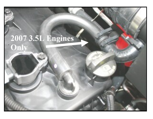
8. For 2007 3.5L Engines , (shown above), slide one end of the 1/2"x 1/2" connector (#10) into the rubber elbow. Slide the other end into the factory breather hose. Install one speed clamp (#9) over the factory breather hose and 1/2" connector as shown.