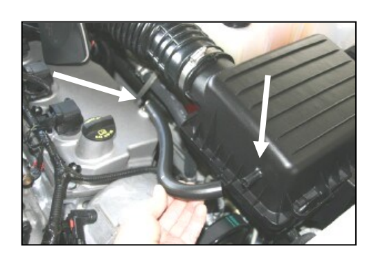
1. <u>Disconnect the negative battery cable</u>. Remove the breather hose from the factory air box lid and valve cover. 2.7L Engines: remove the hard plastic breather tube at the elbow near the back of the valve cover.