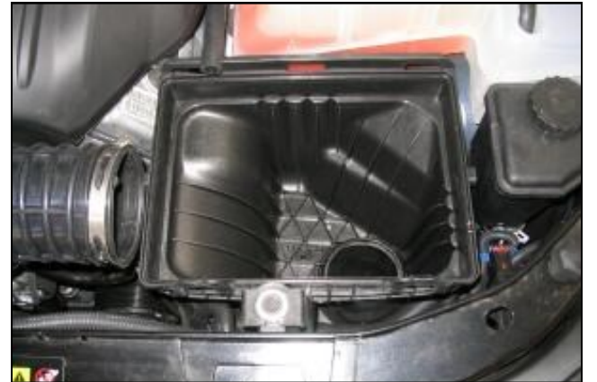
3. Remove the factory air box lid and flat panel filter. ( Note: Retain the factory air box base. )