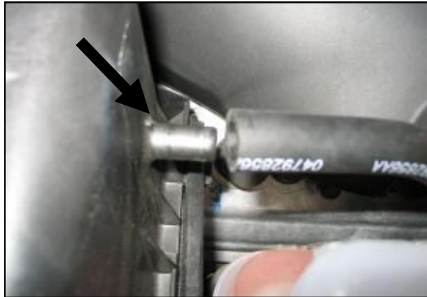
2. Disconnect the breather hose from the factory air box lid.