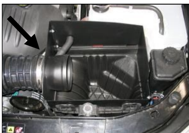
5. Install the Airaid CAD in place of the factory air box lid. Tighten factory hose clamp.