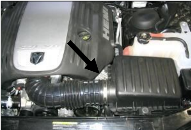
1. Loosen the hose clamp on the intake tube.

Full color instructions can be viewed on our web site at Airaid.com . Use the Product Search function to find your part number, and click View Details .