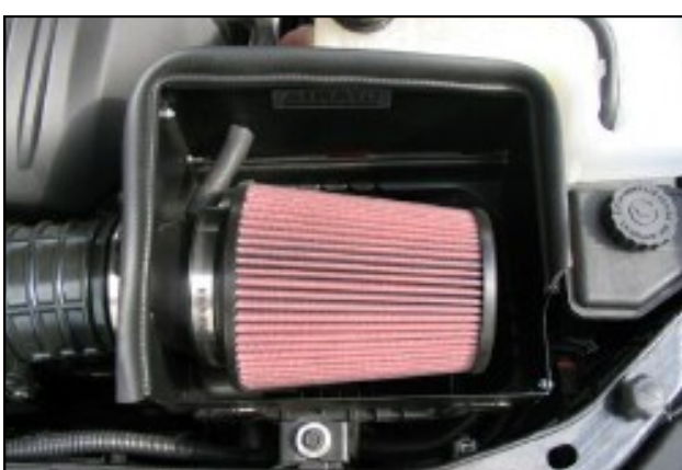
7. Install Airaid filter on the end of the intake tube. Install weather strip on CAD. ( Note: Start from one end of air box and work your way to the other end. )