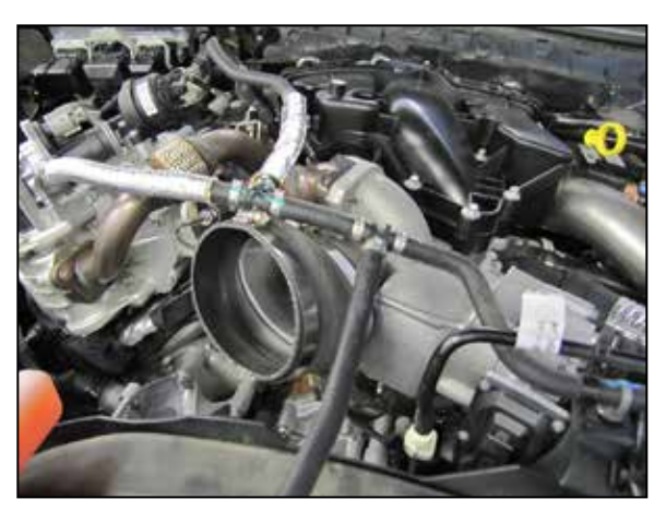
10. Install the provided coupler (08695) onto the turbo inlet and secure with the provided hose clamp.