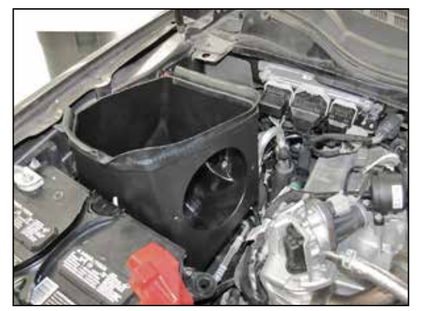
9. Install the AIRAID® housing into the vehicle so the mounting stud inserts into the mounting grommet and the fresh air intake opening sits around the fresh air duct. NOTE: Be sure not to pinch the wiring harness between the fresh air duct and AIRAID® housing.

NOTE: Some trimming of the edge trim will be necessary.