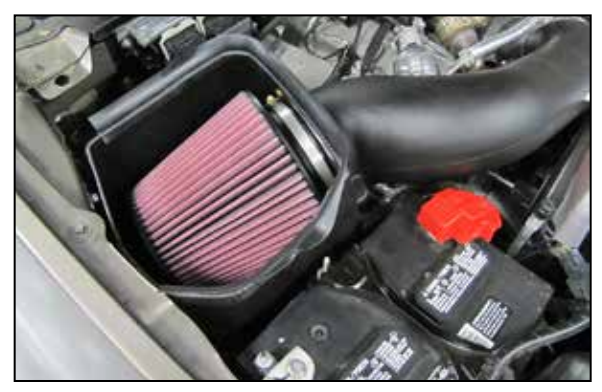
13. Install the air filter onto the intake tube and secure with the provided hose clamp.