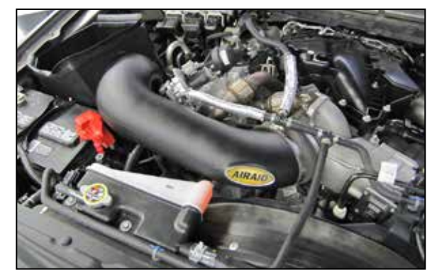
12. Install the AIRAID® intake tube into the AIRAID® housing and into the coupler at the turbo inlet. Adjust the tube for best fit and then secure with the provided hardware and hose clamp.

11. Remove the mass air sensor from the factory air filter housing and install it into the AIRAID® intake tube using the provided hardware and spacers. Install the AIRAID<sup>®</sup> decal onto the intake tube.