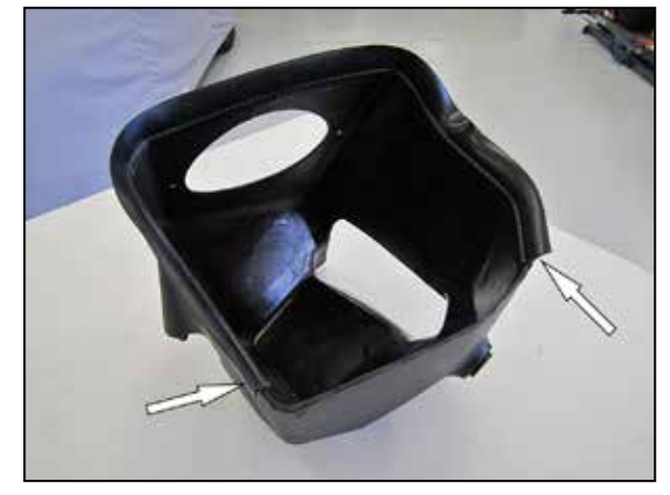
8. Install the provided weather strip onto the AIRAID® housing as shown.

NOTE: Some trimming of the edge trim will be necessary.