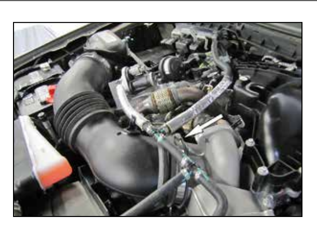
Loosen the hose clamp that secures the factory