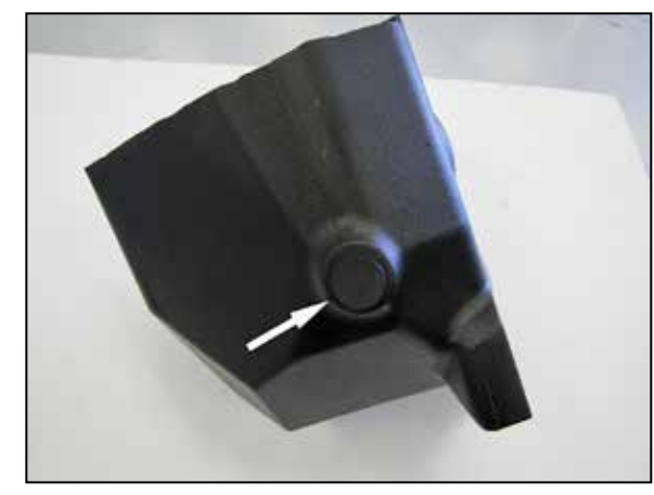
7. Install the provided bumper into the AIRAID® housing as shown.