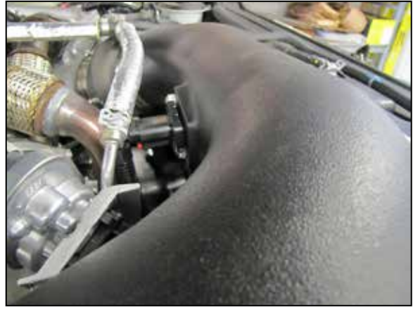
14. Reconnect the mass air sensor electrical connection.