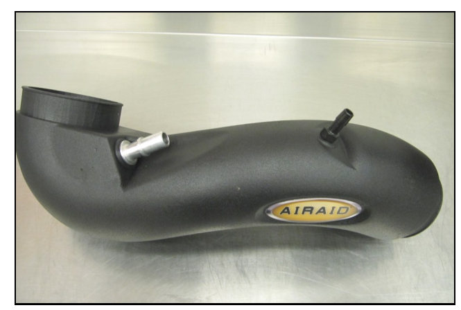
6. A.) Install the 3/8 "Barbed Fitting (#5) into the threaded holt in the Intake Tube.