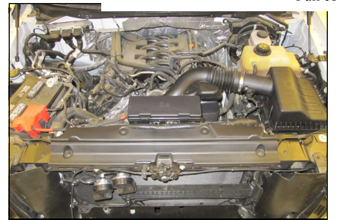
1. Disconnect The Negative Battery Terminal!