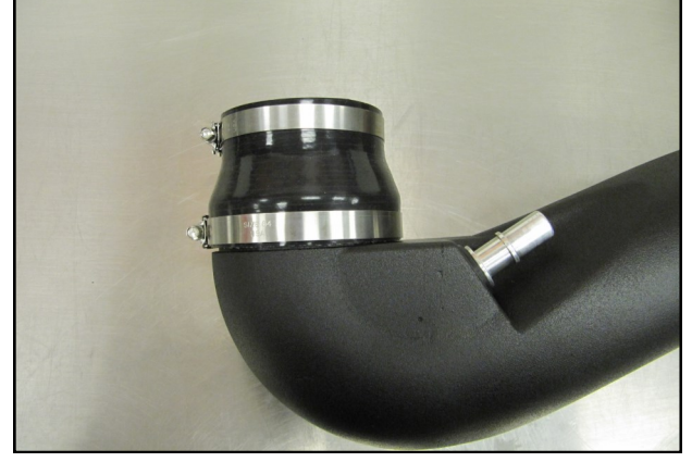
8. Install the Silicone Reducer (#4) and Hose clamps onto the Airaid Intake Tube. Place the #56 Clamp (#18) on the throttle body side of the Reducer, and the #64 Clamp (#9) on to the Tube side.