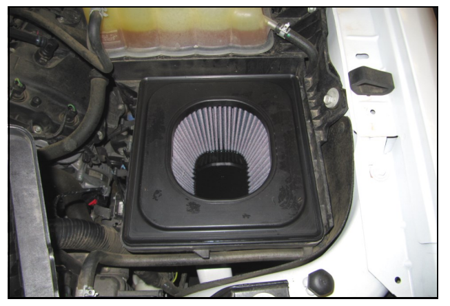
4. Install The Airaid Premium Filter (#1) into the airbox.