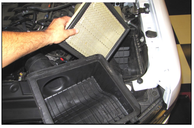
3. If installing the Airaid Jr. Kit, unfasten the three clips on the left side of the factory airbox, and remove the upper half of the factory airbox. Remove the factory air filter element.