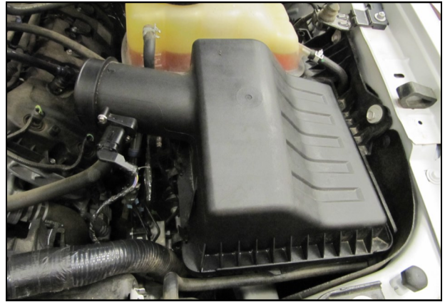
5. Reinstall the airbox upper half.