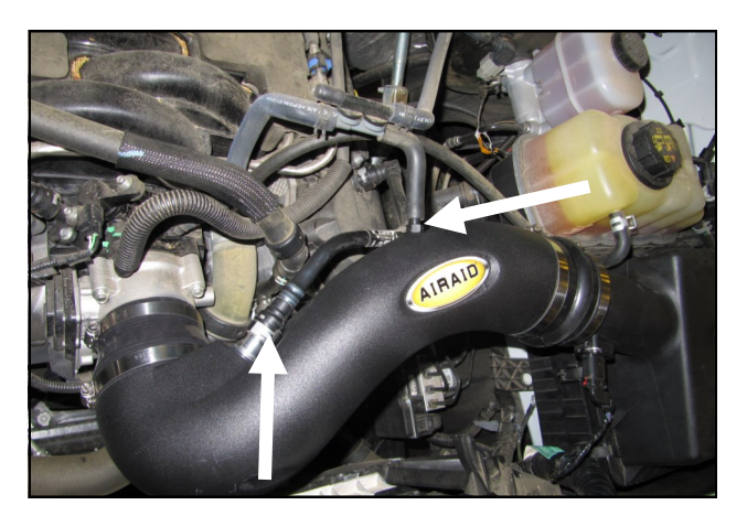
10. Reconnect the breather lines to the Airaid Intake