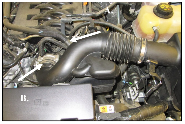
2. A. Disconnect the two breather lines in the factory intake tube .