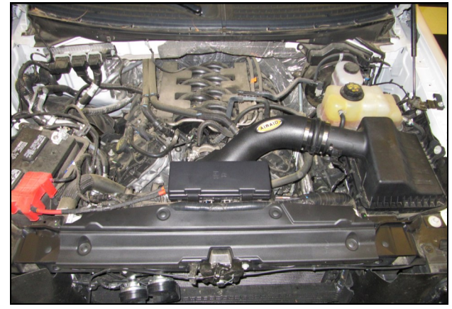
11. Double check your work! Make sure there is no foreign material in the intake path. Make sure all clamps, hoses, bolts, and screws are tight. Double check the hood clearance!