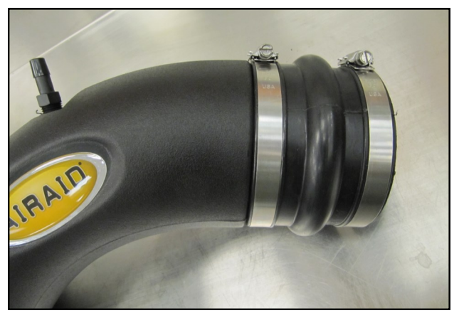
7. Install the hump hose (#3) and two #60 hose clamps (#9) onto the Intake Tube as shown. Leave the hose Clamps loose for now.