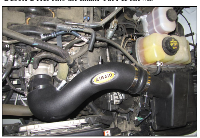
9. Install the Intake Tube onto the throttle body first, then into the airbox. Tighten all of the Hose Clamps.