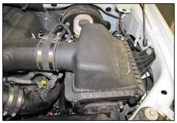
14. Reinstall the upper air filter housing onto the lower housing and into the coupler on the intake tube. Secure the housing to the lower housing with the factory clips and to the intake tube with the provided hose clamp.