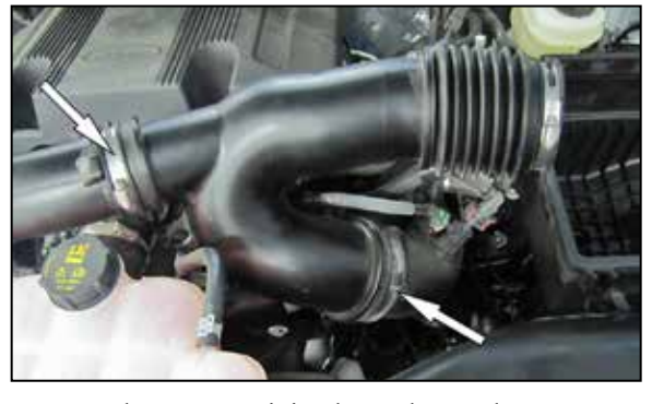
5. Loosen the two remaining hose clamps that secure the factory intake tube to the turbo inlet tubes and then remove the intake tube from the vehicle.

NOTE: AIRAID recommends that customers do not discard factory air intake.