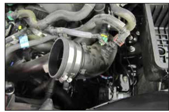
7. Install the provided coupler hose (08761) onto the driver's side turbo inlet tube and secure with the provided hose clamp.

NOTE: AIRAID recommends that customers do not discard factory air intake.