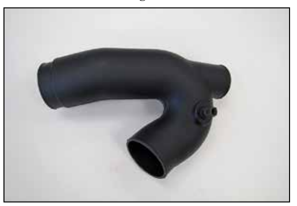
10. Using the provided grommet, install the factory inlet temperature sensor into the AIRAID intake tube as shown.

NOTE: The inlet temperature sensor is very fragile, use caution while handling the sensor.