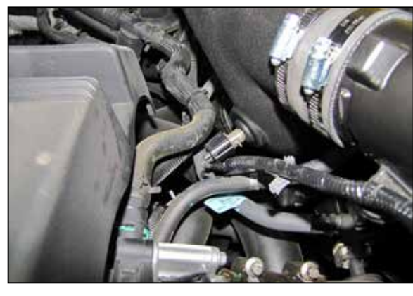
15. Reconnect the inlet air temperature sensor electrical connection.