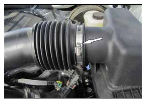
3. Loosen the hose clamp that secures the factory intake tube to the upper air filter housing.