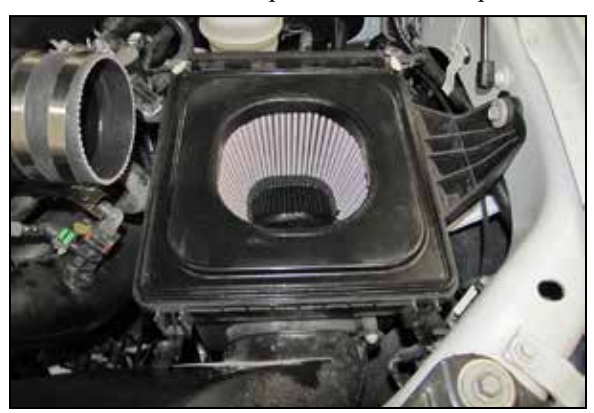
13. Install the AIRAID air filter into the lower air filter housing.