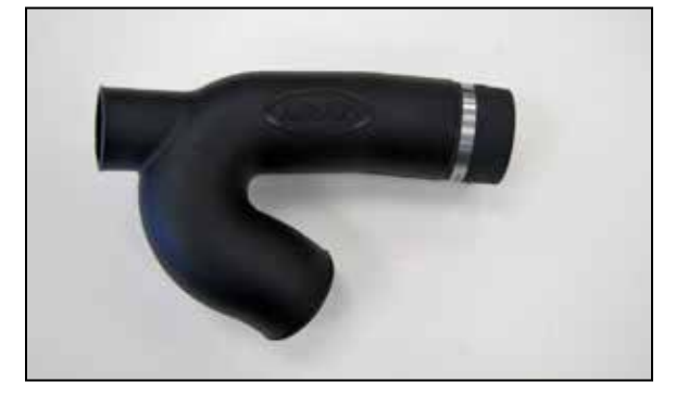
11. Install the provided coupler (08760) onto the AIRAID intake tube as shown and secure with the provided hose clamp.

NOTE: The inlet temperature sensor is very fragile, use caution while handling the sensor.