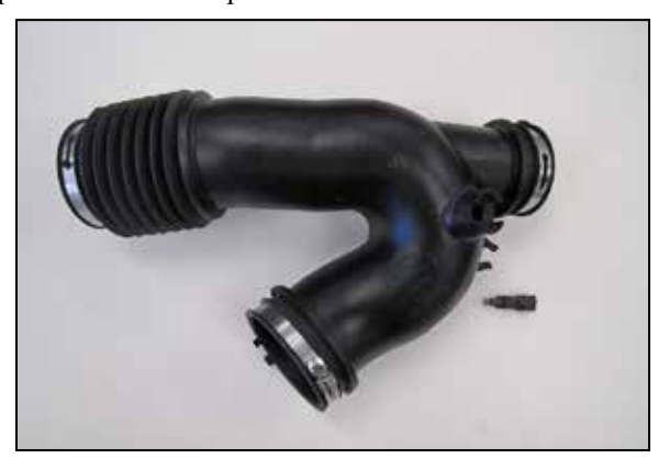
9. Remove the inlet air temperature sensor from the factory intake tube and remove the O-Ring from the sensor.