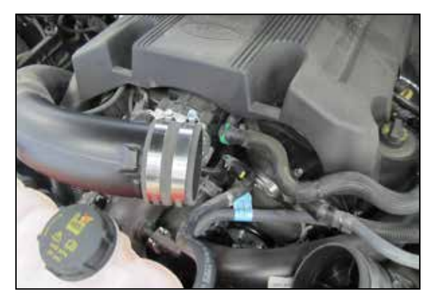
8. Install the provided coupler hose (08711) onto the passenger side turbo inlet tube and secure with the provided hose clamp.