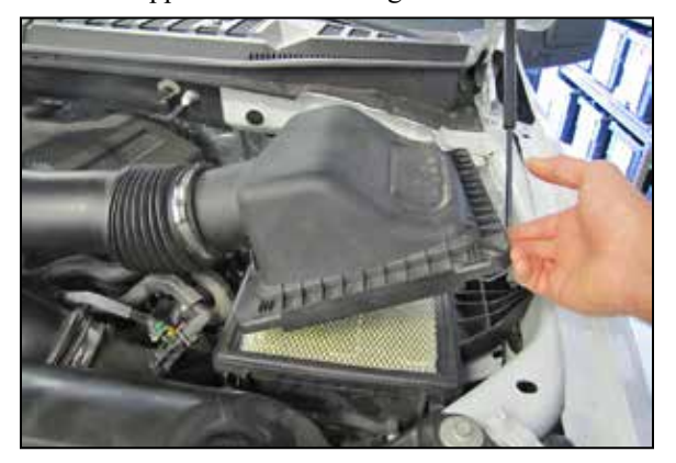
4. Release the locking clamps, lift up the upper air filter housing and then remove it from the vehicle, then remove the factory air filter.