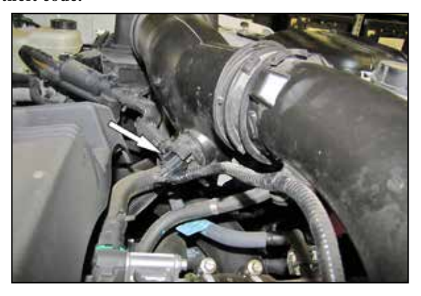
2. Disconnect the inlet air temperature sensor electrical connection.

NOTE: Disconnecting the negative battery cable erases pre-programmed electronic memories. Write down all memory settings before disconnecting the negative battery cable. Some radios will require an anti-theft code to be entered after the battery is reconnected. The anti-theft code is typically supplied with your owner's manual. In the event your vehicles anti-theft code cannot be recovered, contact an authorized dealership to obtain your vehicles antitheft code.