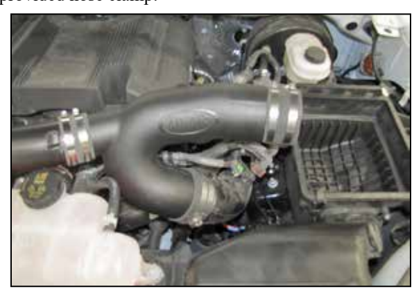
12. Install the AIRAID intake tube onto the turbo inlet tubes and secure with the provided hose clamps.