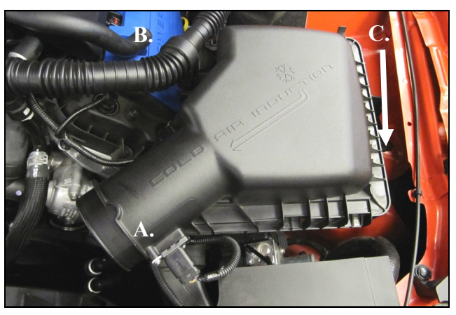
3. A) Slide the red tab out of the connector and disconnect the Mass Air Flow sensor. Carefully pry the harness anchor from the air box using a standard screwdriver. B) Separate the resonator tube from the stand off attached to the Air box lid. C) Using a 10mm socket, remove the bolt securing the air box to the inner fender and remove the air box assembly. This bolt will be reused in step 12.