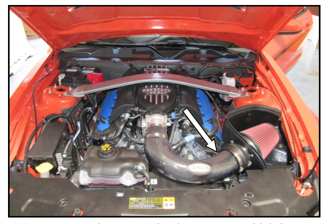
16. Reconnect the Mass Air Flow sensor, which is now located in the lower back side of the intake. Slide the locking tab back into the connector.