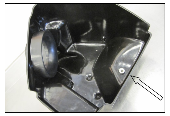
10. Remove the factory upper air box mounting grommet and steel sleeve, and re-install into the Airaid CAB .