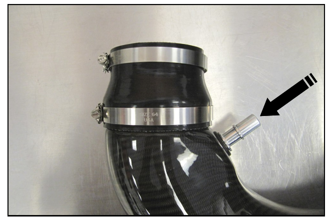
6. A.) Install the Silicone Reducer (#6) and Hose clamps onto the Airaid Intake Tube (#2). Place the #56 clamp (#14) on the Throttle body side of the reducer, and the #64 clamp (#13) on to the tube side.