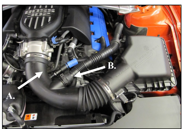
2. A) Loosen the hose clamps on the factory intake tube B) Squeeze the clamp and disconnect the resonator from the air intake tube. C) Carefully depress the hose lock tab and disconnect the crank case breather line. D) Remove the factory intake tube.