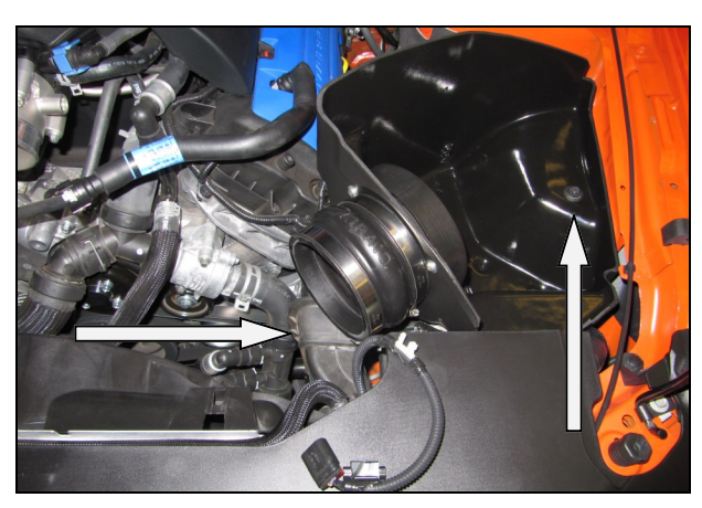
12. Install the CAB into the vehicle. Make sure that the air inlet of the CAB aligns with the factory duct, and the two locating pins on the bottom are seated in the factory grommets. Next reinstall the factory bolt that was removed in step #3 thru the steel sleeve and grommet and into the inner fender.