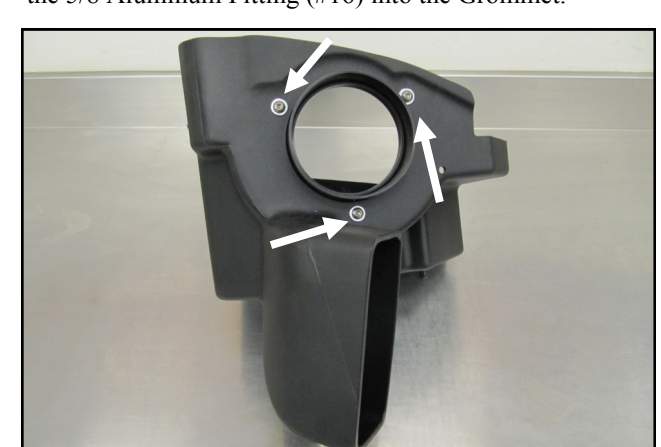
9. Install the Filter Adapter (#7) onto the Airaid Cool Air Box (#4) as shown.

Use the three 1/4-20 button head bolts (#9), and flat washers (#10) to secure the Adapter.