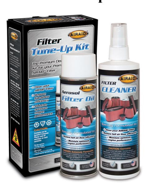
P/N 790-551 Aerosol Spray P/N 790-550 Squeeze Spray