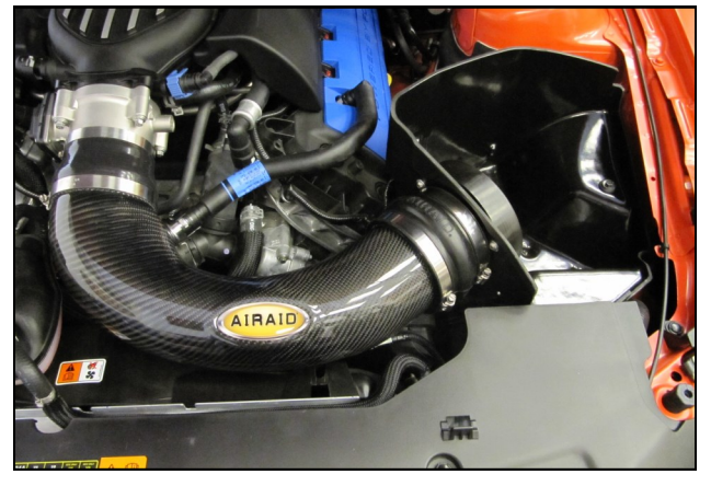
13. Install the Airaid Intake tube onto the throttlebody first then into the Hump Hose and tighten the clamps. Reconnect the crank case breather line to the Aluminum fitting on the Intake Tube.