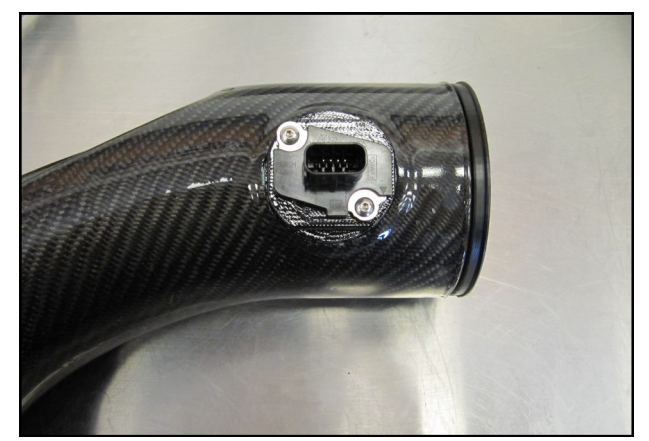
8. Install the Mass Air Flow sensor into the intake tube using two provided 8-32x3/8" screws (#11).