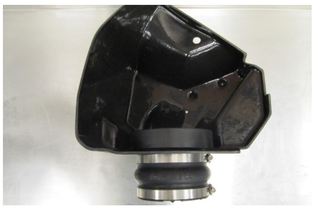
11. Install the hump hose (#5) and two #72 hose clamps (#12) onto the filter adapter as shown. Leave the two hose clamps loose for now.