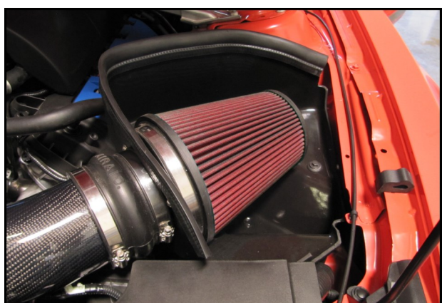
15. Install the Airaid Premium Filter (#1) onto the filter adapter and tighten the hose clamp.