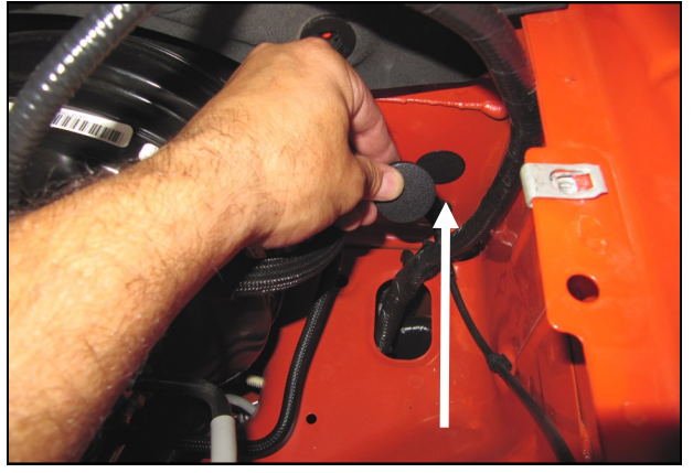
5. Plug the resonator hole in the firewall with the Firewall Plug (#15).