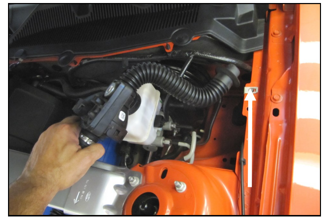
4. Unbolt the Intake resonator from the inner fender and disconnect it at the drivers side firewall. Remove the entire assembly from the vehicle and set it aside. It will not be reused.