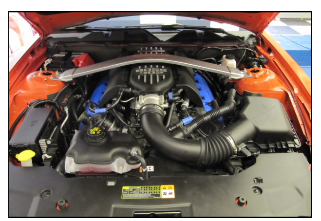
Disconnect The Negative Battery Terminal! 1. Make sure the ignition switch is turned off and the parking brake has been set.