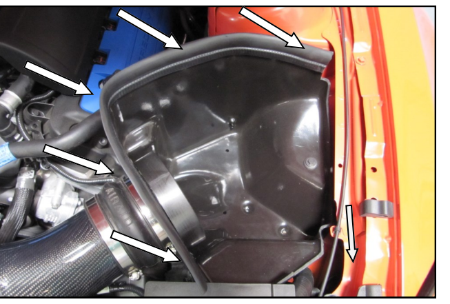
14. Install the Weather Strip (#8) onto the Cool Air Box with the contoured edge rolling away from the filter area. Start at the front of the vehicle and work your way back