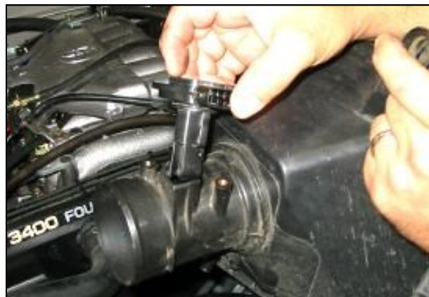
5. Loosen the two screws on the Mass Air Sensor and remove the sensor from the factory air box. Retain sensor for later use.