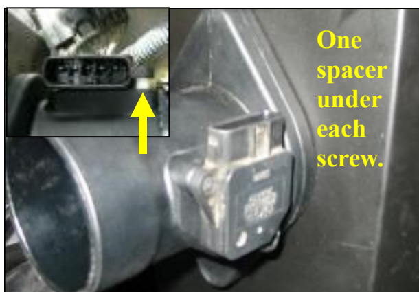
8. Using the two 8-32 Allen head screws and two plastic spacers provided, mount the factory Mass Air Sensor to the Airaid filter adapter tube. (Note: the plastic spacers are placed between the Mass Air Sensor and the Filter Adapter Tube with the screws sliding through the spacers).