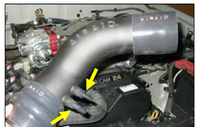
9. Install two supplied 1/4" NPT barbed fittings in Airaid intake tube. (Note: Install 3/8" fitting in the forward hole and the 1/4" fitting in the back hole) Slide hump hose and two #52 hose clamps on large end of intake tube and slide coupler with two #48 hose clamps on small end of tube. (Note: leave all hose clamps loose for final assembly)