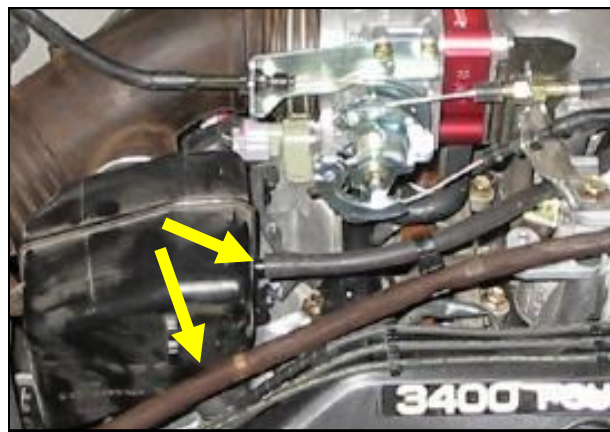
2. Remove factory vacuum lines / hose from the factory air box and intake tube. (Note: Retain the 3/8" vacuum hose)