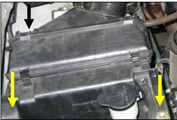
4. With a 12mm socket, remove the three bolts securing the factory air box assembly & remove the factory air box assembly from vehicle.