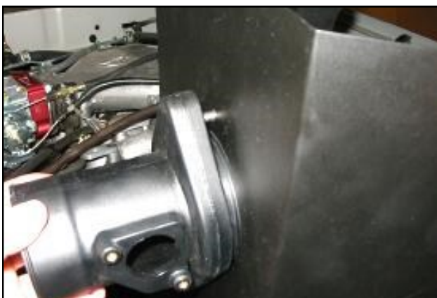
7. Using two supplied 1/4-20 bolts and washers, mount the Airaid filter adapter to the Airaid Cool Air Dam.