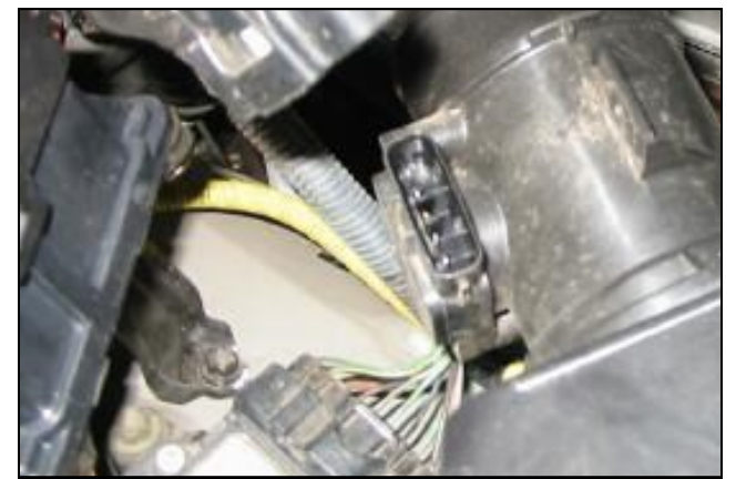
3. Disconnect the electrical connector from the Mass Air Sensor.