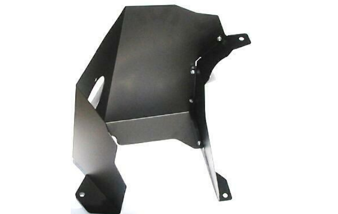
6. Assemble the Airaid Cool Air Dam using four small screws, washers, and nuts provided.