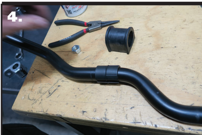
4. Install the Delrin Liner by sliding it over the end of the bar into position. Position it in the area that the bushing will ride based on the location of the stock swaybar. Do this on both ends of the swaybar.