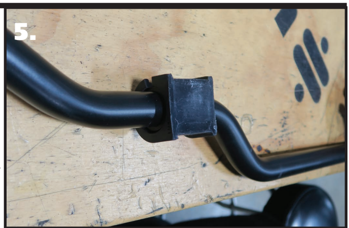
5. Open the SwayBar Bushing at the split and slide it OVER the Delrin Liner. Do this on both Delrin Liners.