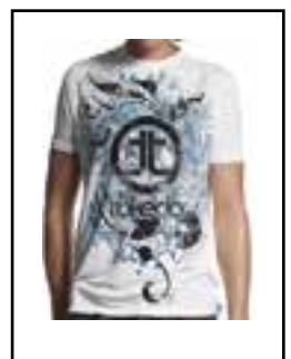
P/N: TP-7004T M P/N: TP-7005T L P/N: TP-7006T XL P/N: TP-7007T 2XL