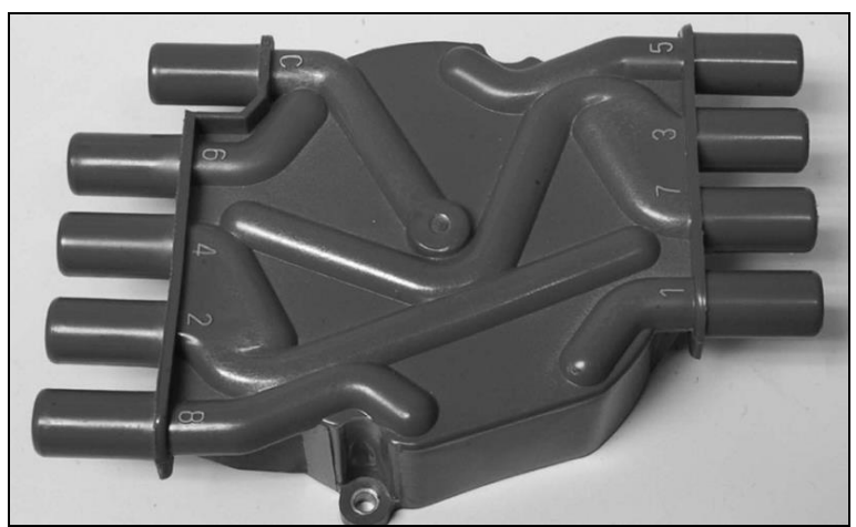
Figure 2 - Distributor Cap