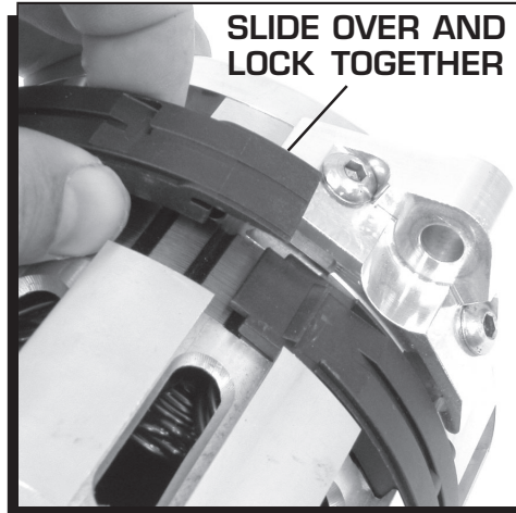
Figure 3 Installing the Cover Ring.