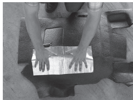
FIGURE 2: DRIVERS SIDE