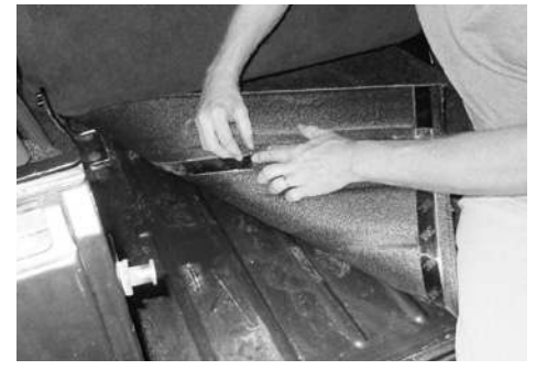
FIGURE 12: F