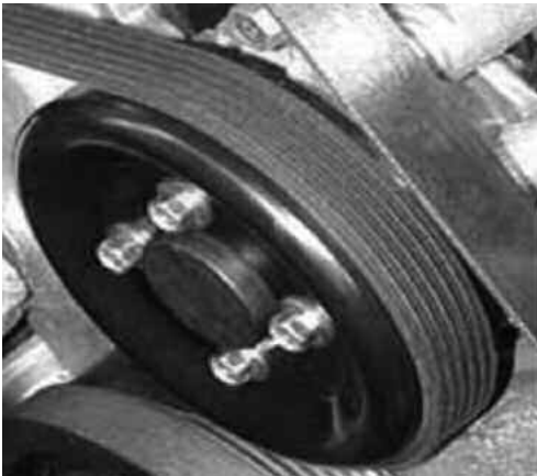
LATE DESIGN – BBK1608