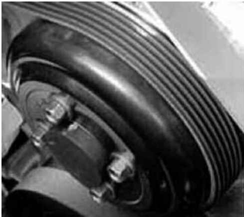
EARLY DESIGN – BBK1564

Refer to the pictures below to determine which pulley design you have. Since there is no definitive answer as to the time line or model years.