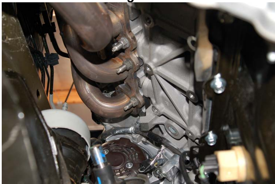
Motor mount removed.