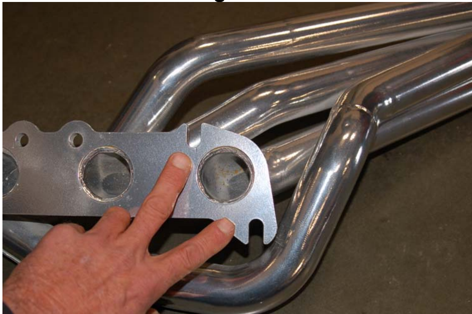
Remove stock studs that correspond with notches in flange. Use supplied bolts.