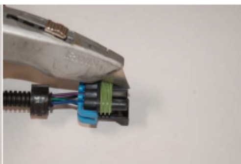
Using a sharp knife