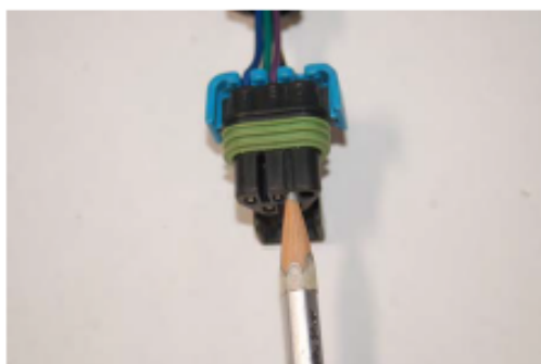
Open this slot up

On the male connector of the provided extension wires, the plastic needs to be trimmed out of the other slot as shown in the pictures. Use a sharp knife to carefully trim out the plastic to open the slot. Also make this modification to the O2 sensor plug.