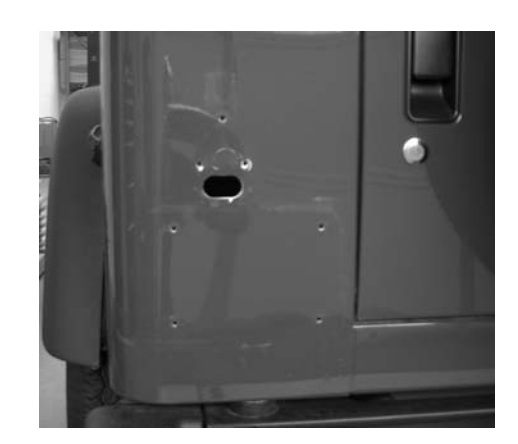
Figure #2 – Remove Tail Light & License Plate