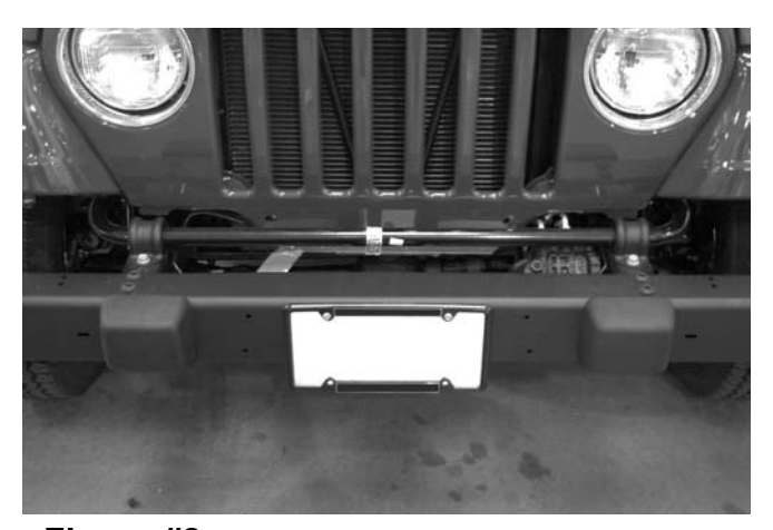
Figure #8 – Factory Front Panel Removed