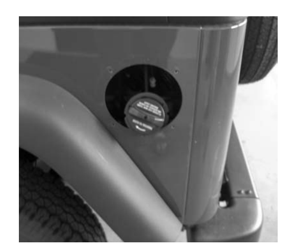
Figure #1 – Remove Gas Tank Outer Flange