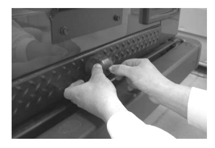
Figure #5 – Reinstall Tire Stop & Tire