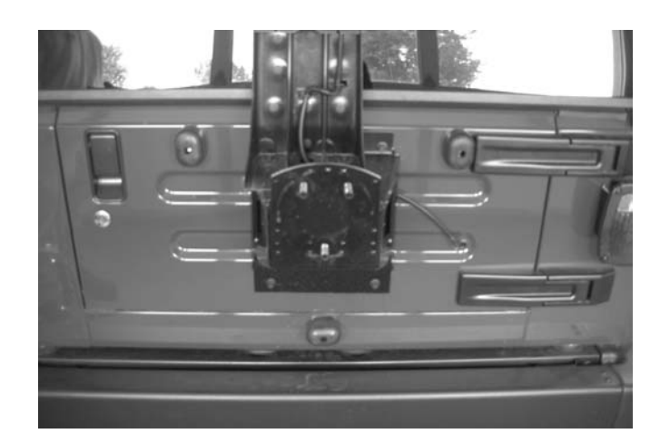
Figure #3 – Remove Spare Tire