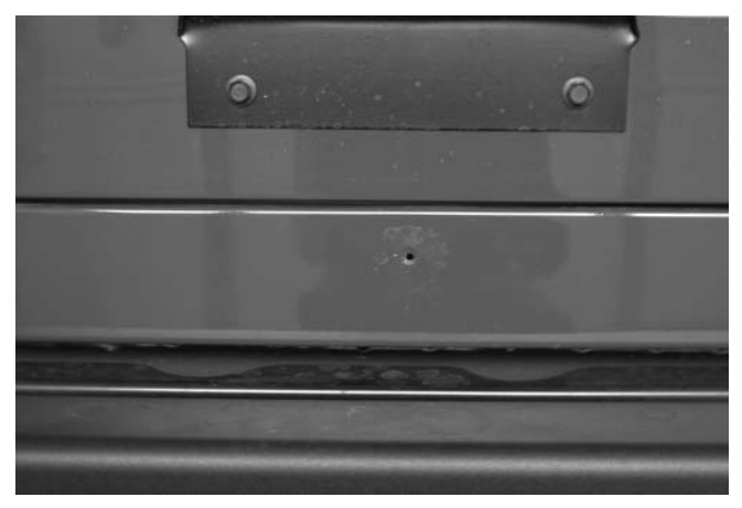
Figure #4 – Remove Tire Stop