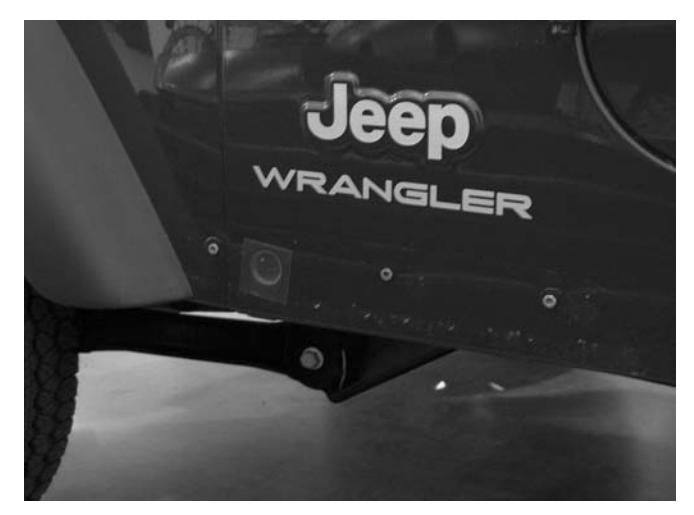
Figure #6 – Remove Stone Guard