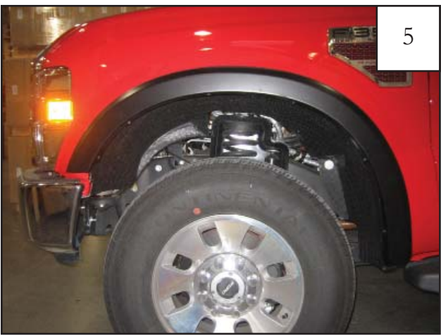
Verify fit and tighten all screws.