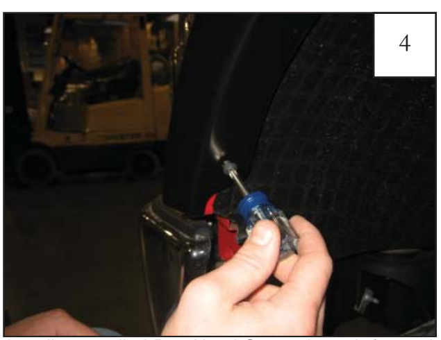
Install a supplied Pan Head Screw through forward hole in flare and into clip installed in Step 2.