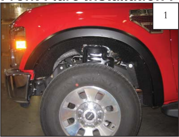
Using a 7/32" socket, remove four factory screws. Retain screws for later use.