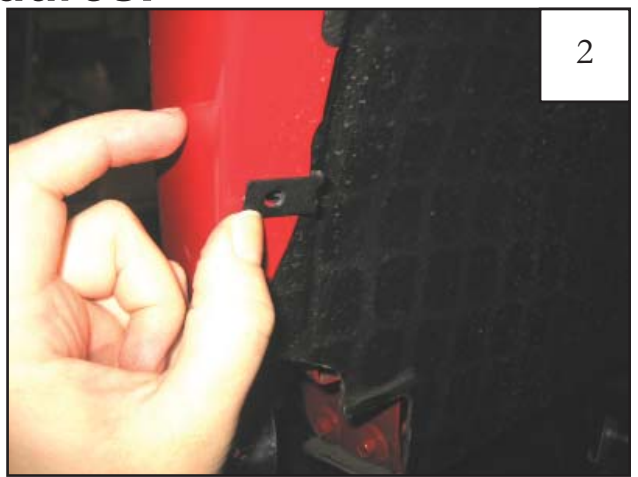
Slide a supplied U Clip over factory hole located at lower front of wheel well.