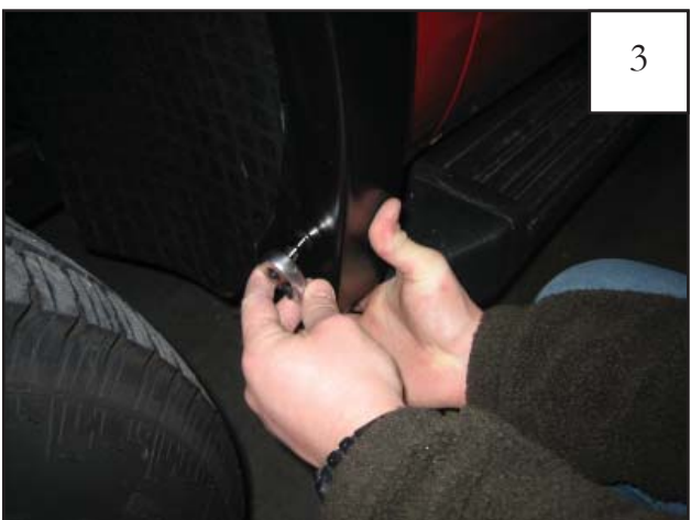
Position flare on fender, and reinstall four factory screws removed in Step 1.