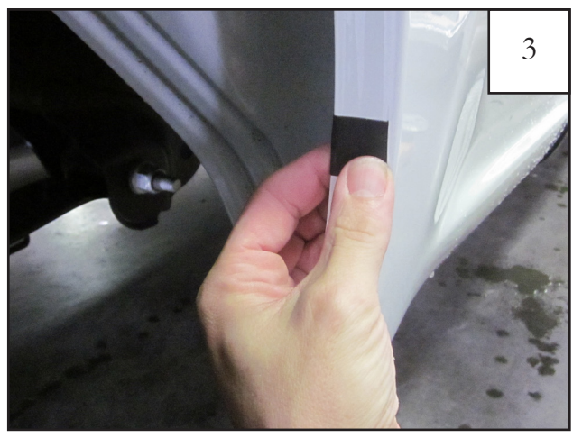
Wrap a Foam Tab (MT1-0034) around the wheel well sheet metal, centered over each of the upper four marks made in Step 2. Place a Mylar Tab (MT1-0014) at the mark made on the lower front of the wheel well.