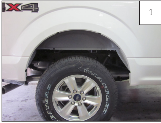
Remove factory fastener from rear of wheel well. Thoroughly clean the vehicle sheet metal and inner flange prior to installation.

Rear Flare Installation Procedures (Passenger's Side):