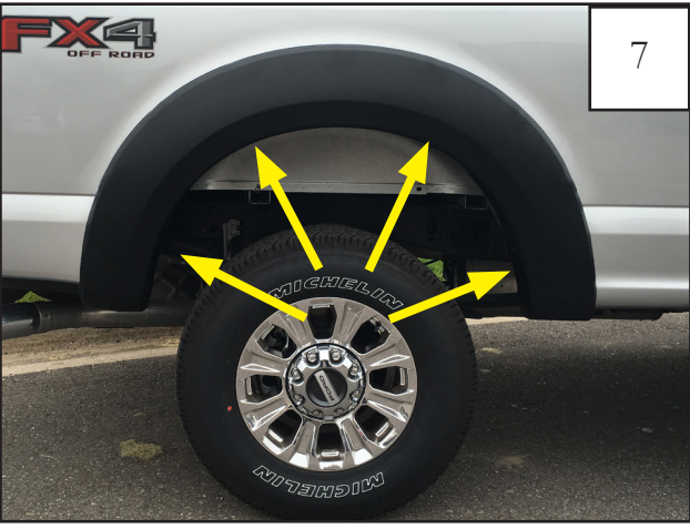
While holding flare to vehicle, start supplied screws (SW1-0058) through the four topmost mounting holes in flare and into the clips installed in Step 5.