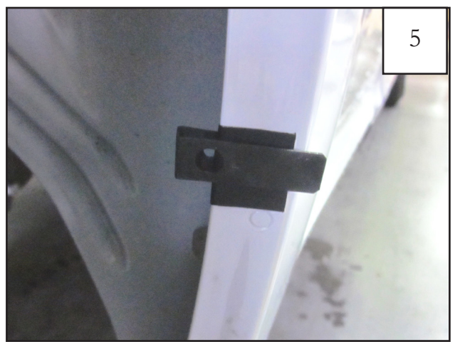
Install a Clip (CL1-0009) over each of the four Tabs (MT1-0034) placed over the upper 4 marks made in Step 3.