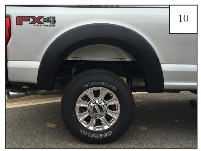
Completed rear flare installation.