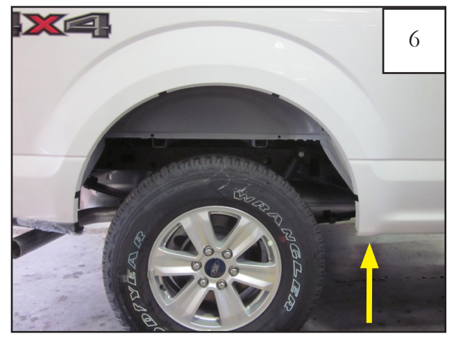
Install a supplied "S" clip (CL1-0005) over the mylar tab installed at the lower front of the rear wheel well.