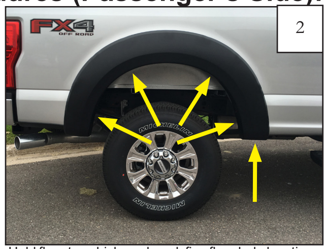
Hold flare to vehicle and mark five flare hole locations with a grease pencil.