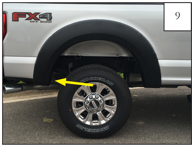
Install supplied push retainer (RV1-P0001) into flare and through factory hole at rear of wheel well.