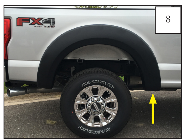
Start a supplied screw (SW1-0050) through the flare into the clip installed in Step 6. Tighten all screws.