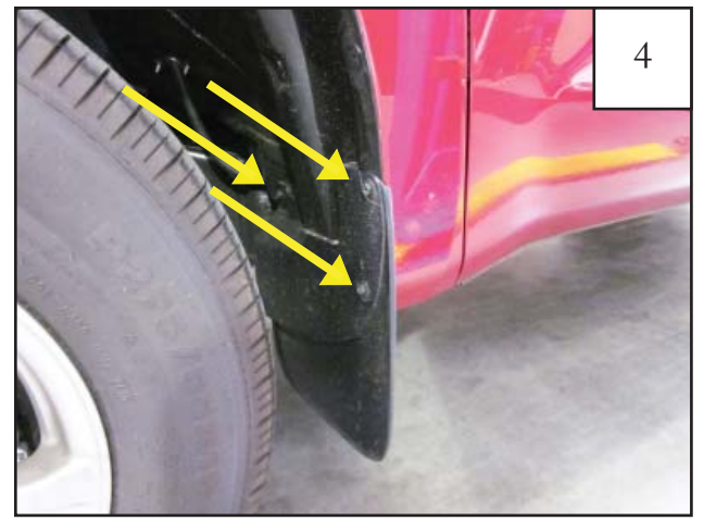
Remove three hex bolts from factory mud flap, using a 10mm socket.