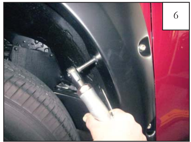
Start supplied Screw (SW1-0036) through top rear hole in flare and into factory hole in rear of wheel well. Do not tighten.