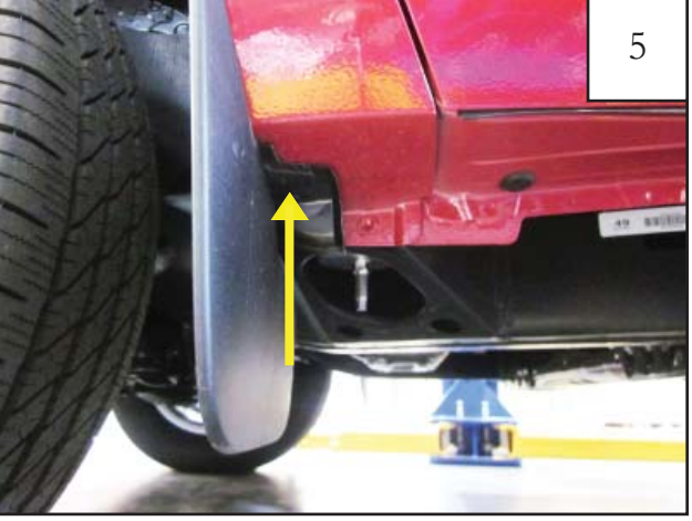
Remove one hex bolt from underside of mud flap using a 10mm socket. Discard mud flap