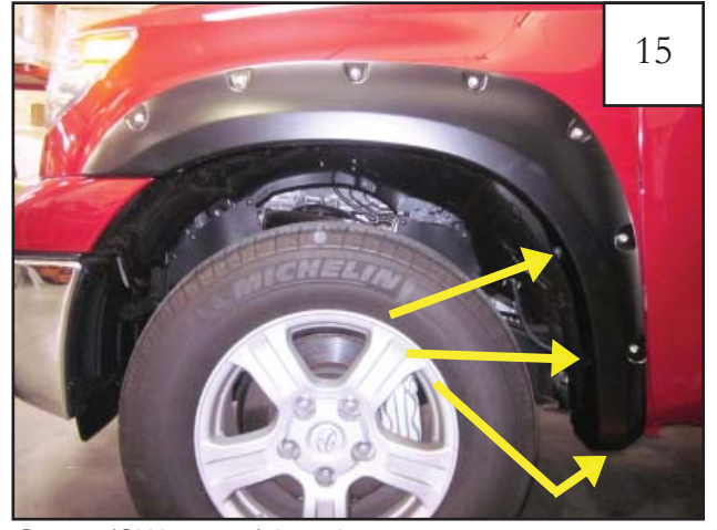
Screw (SW1-0036) locations.