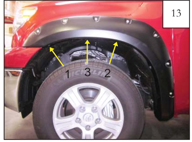
Start Screw (SW1-0050) in location #1 first, then move to #2, and start in location #3 last.