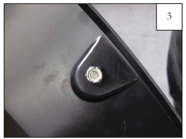
Place a Nut (NU1-0019) over the end of each Bolt and tighten, using a 1/2" wrench for the Nut and the supplied Torx Bit (SW1-0052) for the Bolt. Repeat for remaining pockets.