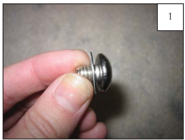
Put a Washer (WA1-0012) on each Bolt (SW1-0059).