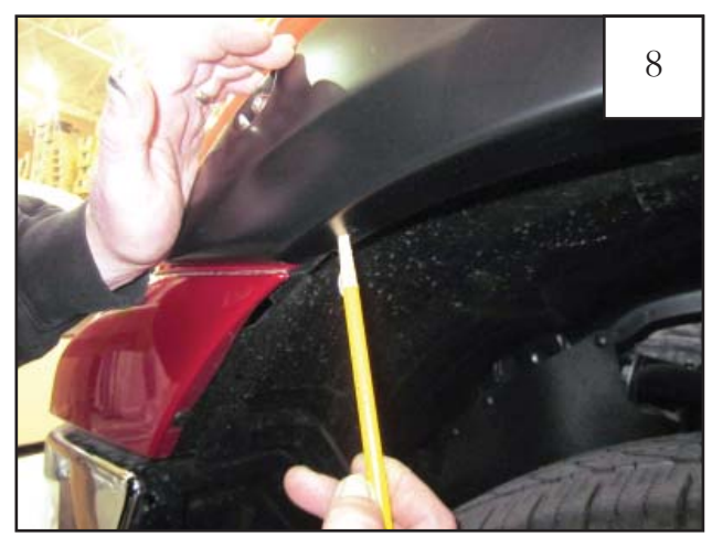
Hold front of the flare firmly on the fender. Mark three Clip (CL1-0005) locations using the holes in the flare as a guide.