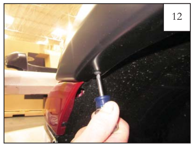
Align holes in flare with holes in Clips (CL1-0005). Start a supplied Screw (SW1-0050) through holes in flare and into each Clip (CL1-0005) installed in Step 11 in the order shown in Step 13. If necessary, use an awl to locate holes in clips.