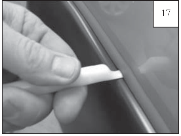
Using flat end of supplied Edge Trim Tool (ET1-0001), seat edge trim against flare by inserting straight end between edge trim and flare at one end. Next, slide around entire edge to the other end.