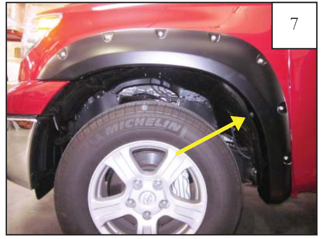
Screw (SW1-0036) location.