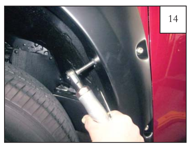
Start Screw (SW1-0036) through the three lower rear holes in flare and into factory holes in rear of wheel well.