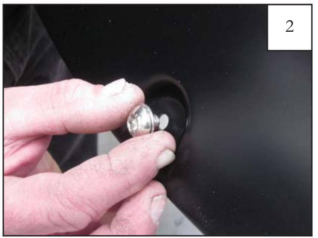
Put each Bolt through a pocket hole in the flare, bolt head on the outside.