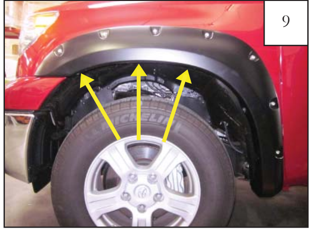
Three marked Clip (CL1-0005) locations.