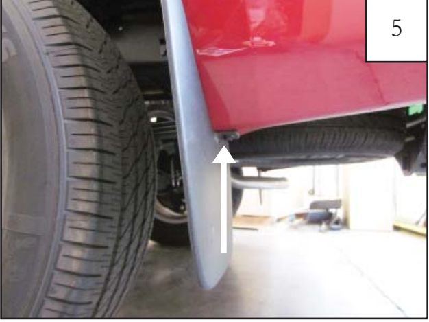
Remove one hex bolt from underside of mud flap using a 10mm socket. Discard mud flap.