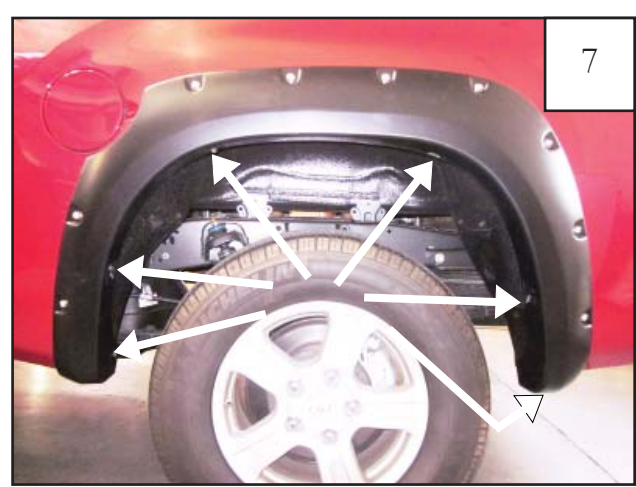
Hold flare firmly on the fender. Start a supplied Screw (SW1-0036) through each hole in flare and into hole in fender. (6 locations)