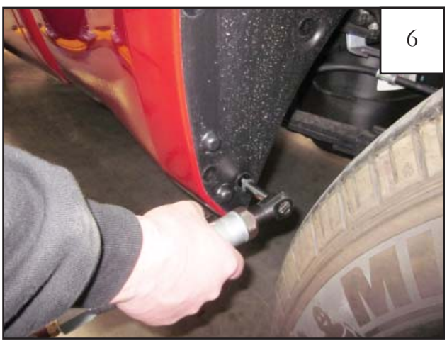
Using a socket wrench with a 10mm socket, remove lower screw from front of rear wheel well as shown.