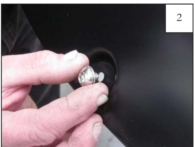
Put each Bolt through a pocket hole in the flare, bolt head on the outside.