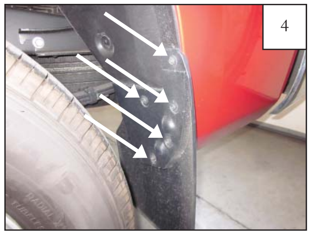
Remove five hex bolts from factory mud flap using a 10mm socket.