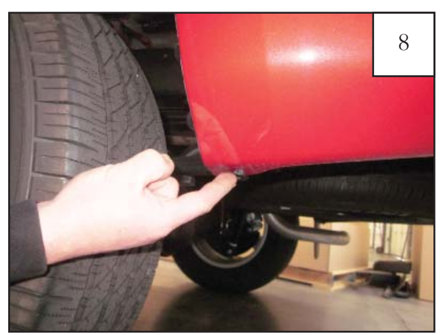
NOTE: If the lower rear wheel well does not contain a plastic grommet, insert supplied Grommet (GR1-0001) into the factory hole as shown.