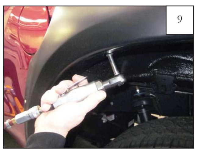
Ensure flare is properly positioned and tighten all screws.