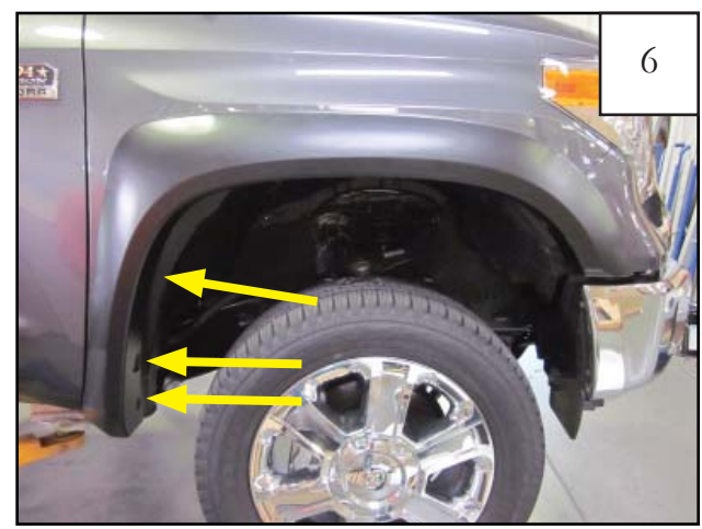
Start three supplied 20mm Hex Screws (SW1-0036) through three rear holes in flare and into factory holes in rear of wheel well.