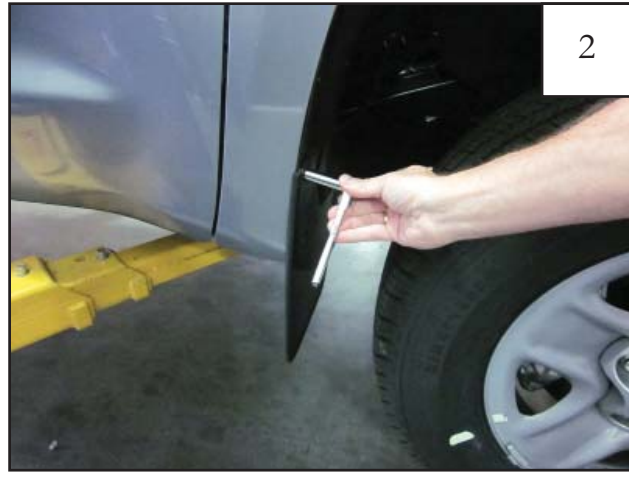
Using a 10mm socket, remove all factory screws from factory mud guard.