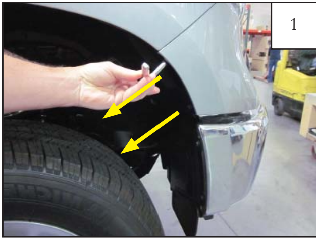
Using a 10mm socket, remove two factory fasteners from front of wheel well.