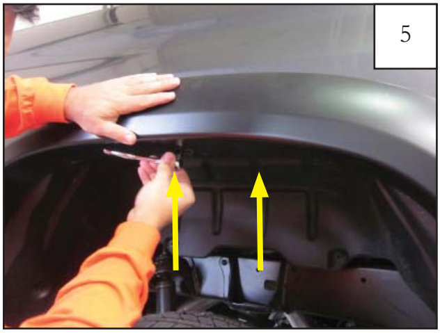
Place flare on fender, aligning holes with clips on the bracket. Start two supplied 20mm Hex Screws (SW1-0036) through two holes on the top of the flare and into clips.