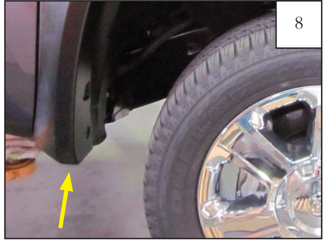
Install supplied push retainer (RV1-P009) into factory hole on underside of mudguard.