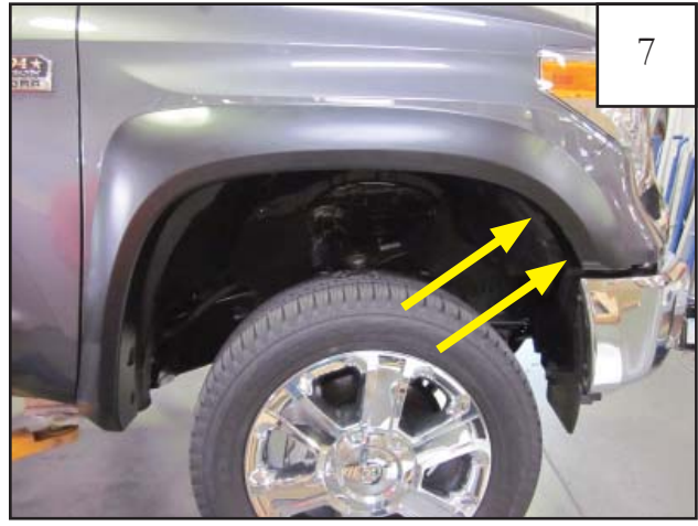
Start two supplied 20mm Hex Screws through forward most holes in flare and into factory hole locations.