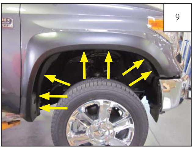
Ensure flare is properly positioned and tighten all screws. (Repeat steps for other side of vehicle) Installation Complete.