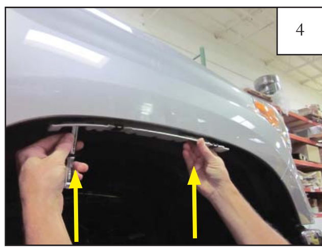
Using two supplied 20mm Hex Screws (SW1-0036), attach bracket to factory holes with a 10mm socket.