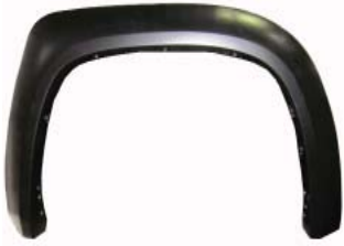
Driver Side x1