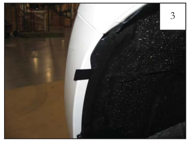
Remove flare from fender. Center a supplied black tab over each mark made in Step 1.