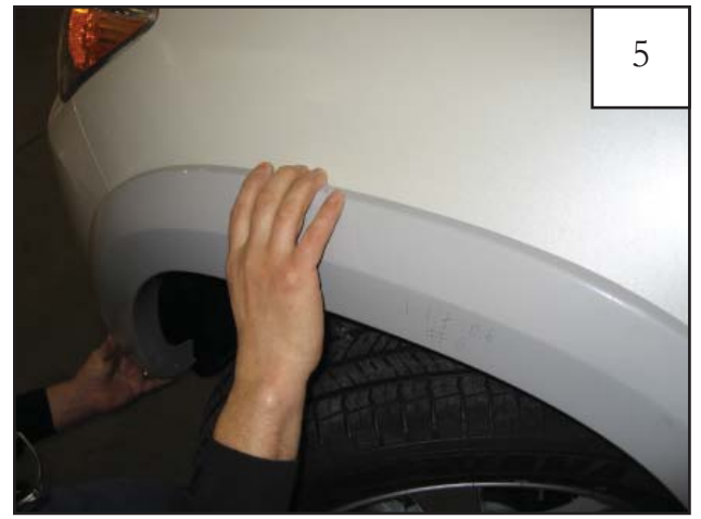
Replace flare on fender, aligning holes with the holes in clips.