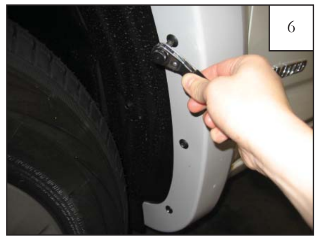
Start supplied truss-head screws through three rear holes in flare and into factory holes in rear of wheel well.