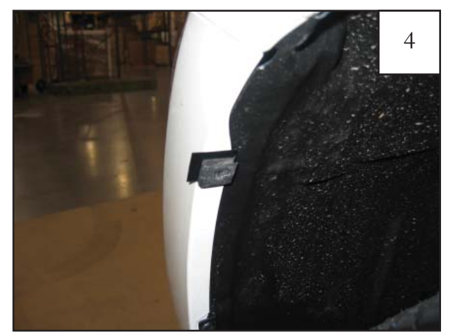
Slide a supplied "S" clip over each tab applied in Step 3.