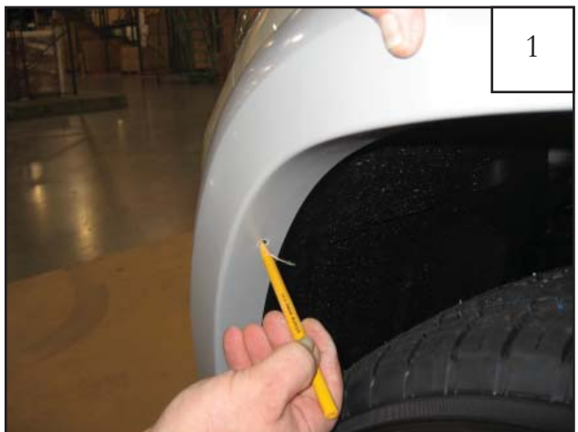
Hold the flare firmly on the fender. Using three forward holes in the flare as a guide, mark three clip locations with a grease pencil.