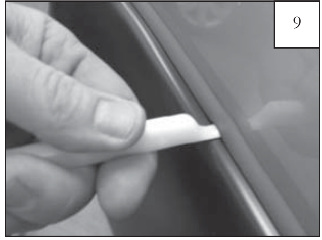
Using flat end of supplied Edge Trim Tool, seat edge trim against flare by inserting straight end between edge trim and flare at one end. Next, slide around entire edge to the other end.

Using supplied Edge Trim Tool, seat edge trim against vehicle by hooking curved end under edge trim at one end of flare. Next, slide around outer edge of flare to the other end.