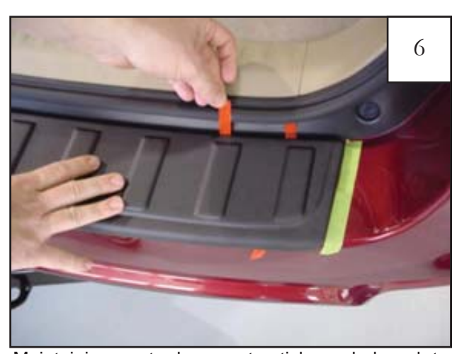
Maintaining part placement, stick peeled end to bumper and begin pulling center tab. Continue pulling center tab while applying pressure. Repeat process for liner the front of the vehicle, and the liner towards the back of the vehicle.