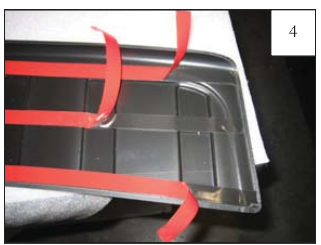
Peel the red plastic liner from the tape strips located on the inside of the bumper protector. NOTE: Make sure tabs are folded toward the outside of the part and that the middle tape liner is in front of rear liner.