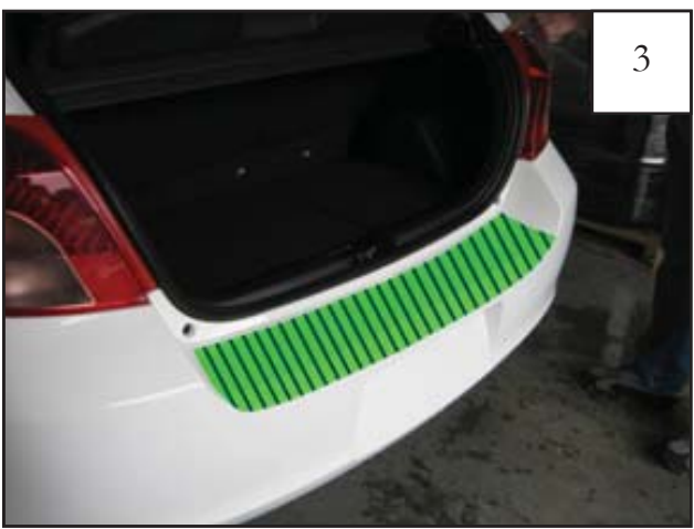
Make sure that all installation surfaces are free of dirt and/or grease. Use a clean, lint-free cloth and isopropyl alcohol-based cleaner.