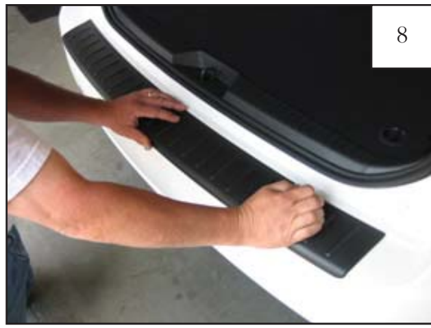
Press the part into place starting at the left side, pushing downward and forward while working your way to the right. Apply 30 PSI to the taped areas for proper bond. Tape reached maximum adhesive bond after 24 hours of contact.