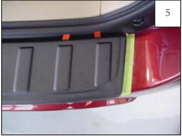
Hold the part at an angle to prevent tape from prematurely sticking, and align the part on the bumper by centering bump in rear door sill between two center ribs in part and using the masking tape applied in Step 2 as a guide.