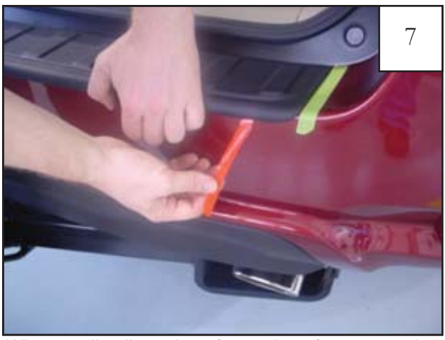
When peeling liner along front edge of part, run edge trim tool along under part in front of liner to create a small gap for ease of liner removal.