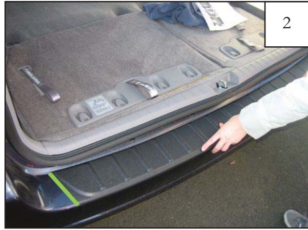
Apply a piece of masking tape along both edges of part for ease of placement during installation.