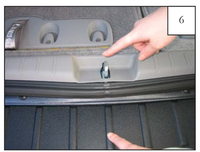
Hold the part at an angle to prevent tape from prematurely sticking, and align the part on the bumper by aligning center rib in part with metal loop on striker and using the masking tape applied in Step 2 as a guide.