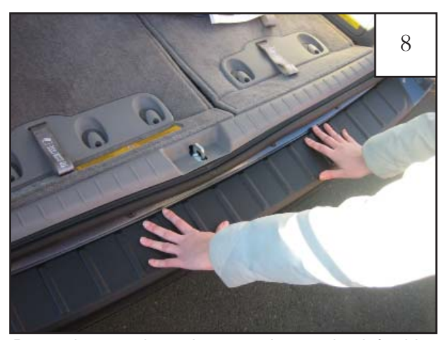
Press the part into place starting at the left side, pushing downward and forward while working your way to the right. Apply 30 PSI to the taped areas for proper bond. Tape reached maximum adhesive bond after 24 hours of contact.