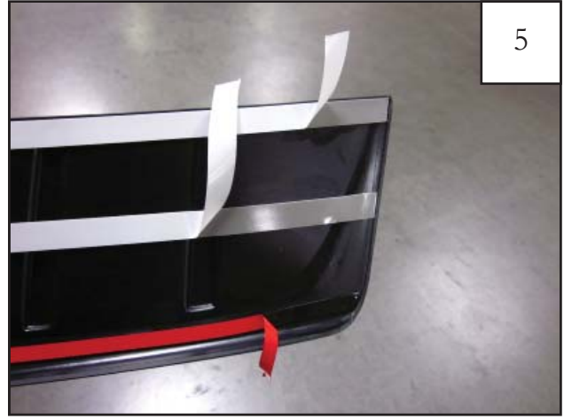
Peel red liner partially from tape pads. NOTE: Make sure tabs are folded toward the outside of the part and that the middle tape liner is in front of rear liner.