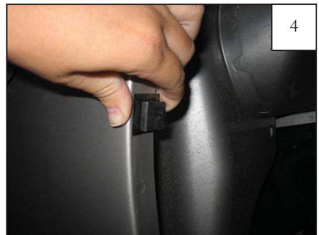
Slide a supplied clip over each black tab. Clips may need to be adjusted to align with holes in flare.