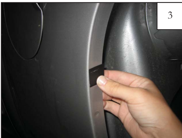
Center a supplied black plastic tab over each mark made in Step 1, aligning edge of tab with inside of fender lip (tab may extend over outside of fender).