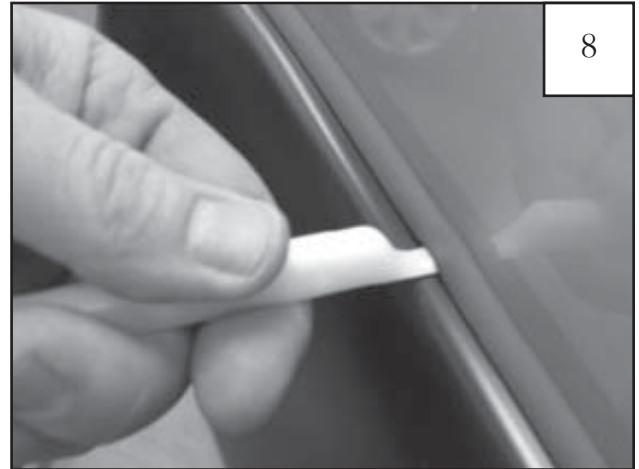
8 Using flat end of supplied Edge Trim Tool (ET1-0002), seat edge trim against flare by inserting straight end between edge trim and flare at one end. Next, slide around entire edge to the other end.