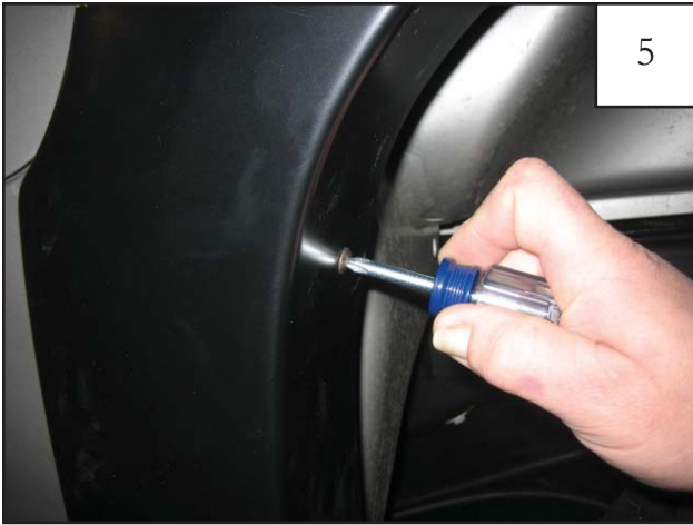
5 Reposition flare on fender. Start a supplied serrated-flange screw through the hole in the flare, and into each clip.