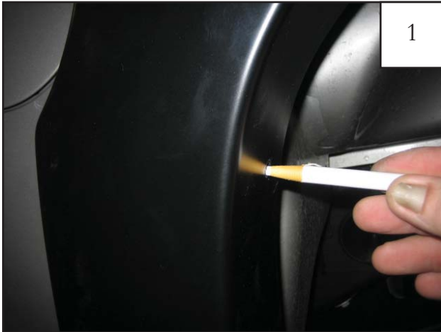
Holding flare in position on fender, use a grease pencil to mark six hole locations.