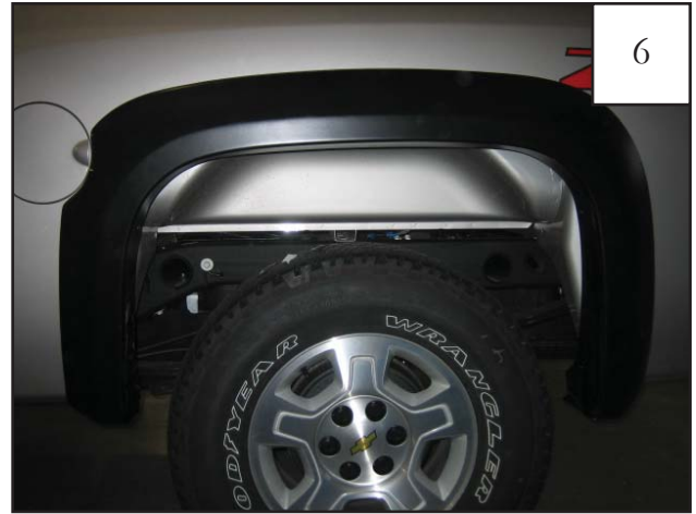
6 Install Clip (CL1-0011) over fender wheel well lip. See step 6.