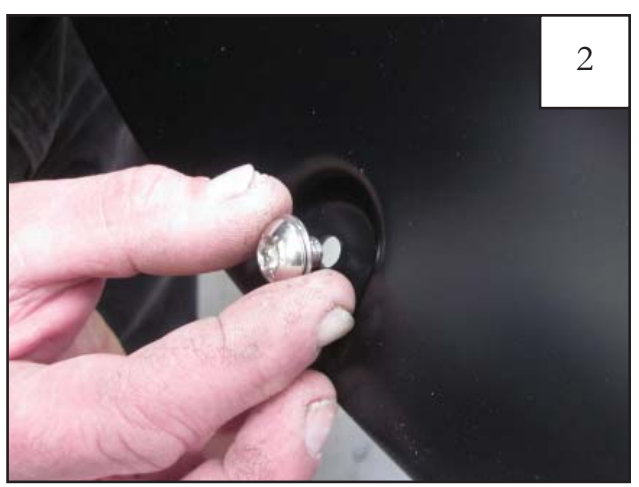
Put each Bolt/Washer combination through a pocket hole in the flare, Bolt head and Washer on the outside.