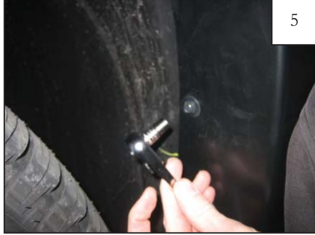
Holding flare in position on fender, reinstall factory screws removed in Step 4. It is helpful to install the one second from bottom first.