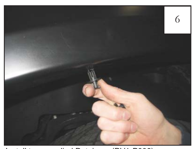
Install two supplied Retainers (RV1-P006).