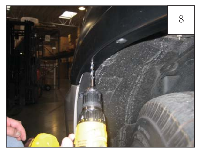
Using hole located in forward portion of flare as a guide, drill through the splash shield with a 5/16" bit. Holes in flare and splash shield should align with factory hole located in fender.