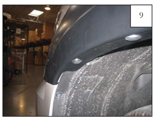
Install a supplied Retainer (RV1-P006) through forward hole in flare.