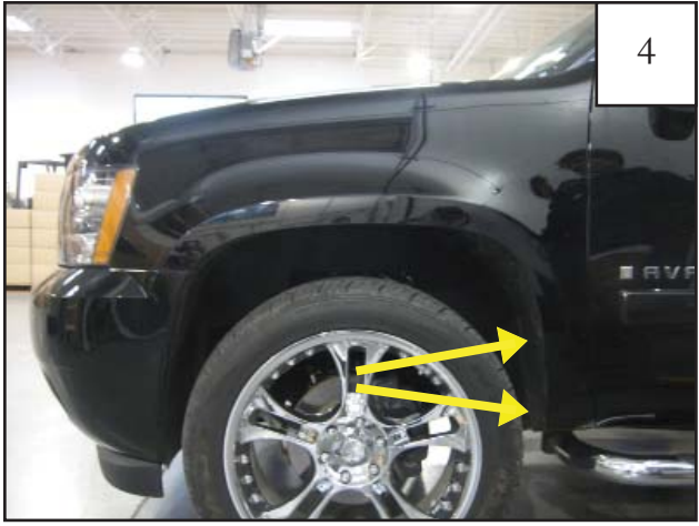
Using a 7mm socket, remove two factory screws. Retain screws for later use.