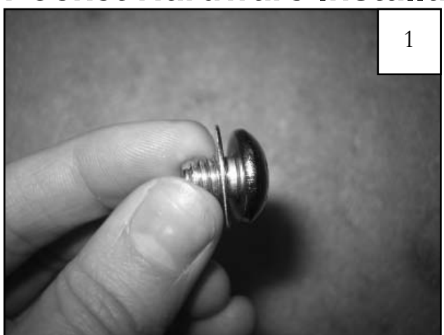
Put a Washer (WA1-0012) on each Bolt (SW1-0067).