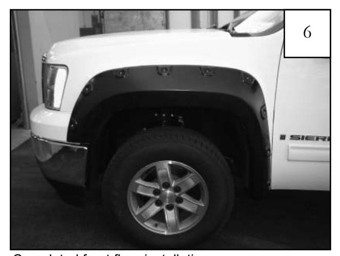
Completed front flare installation.