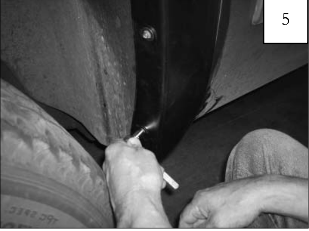
Position flare on fender and reinstall six factory screws removed in Step 4. If needed, use an awl to locate holes.