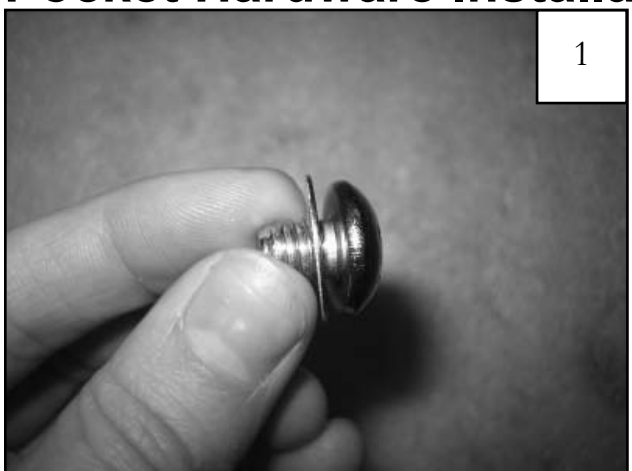
Put a Washer (WA1-0012) on each Bolt (SW1-0059).