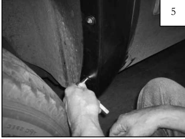
Position flare on fender and reinstall six factory screws removed in Step 4. If needed, use an awl to locate holes.