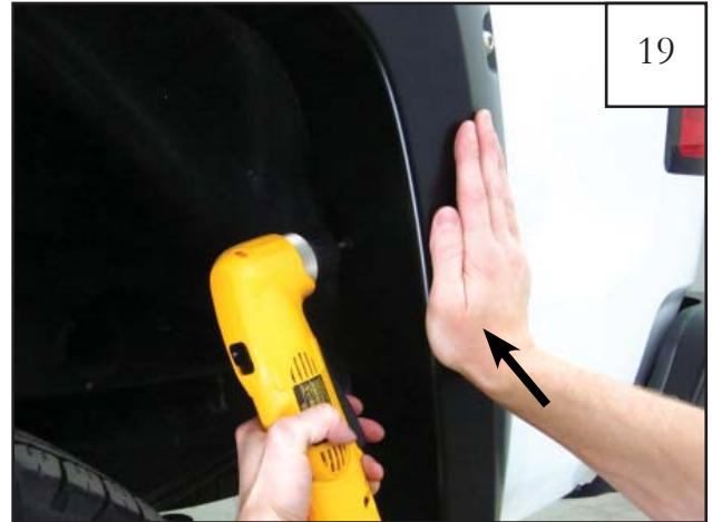
Install self-tapping screws (SW1-0015) into pilot holes drilled in step 36 (3 places). Press flare firmly towards the vehicle while fully tightening.