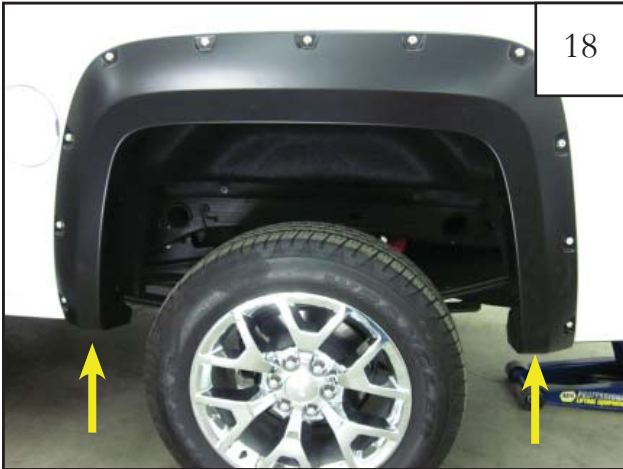
Reinstall the lower 2 factory fasteners removed in step 27 using a 10mm deep socket and wrench.