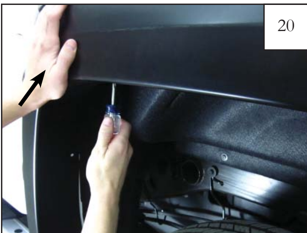
Press flare towards vehicle and fully tighten all remaining fasteners.