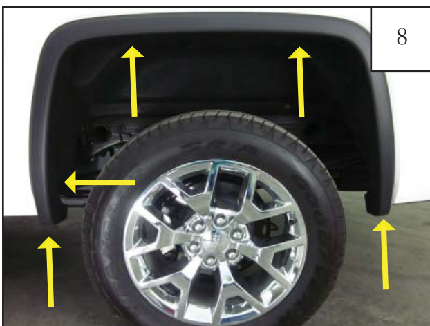
Remove fasteners from factory wheel arch molding using a T-15 Torx Bit for upper and lower wheel well fasteners and a 10mm deep socket and wrench for the lower 2 locations.