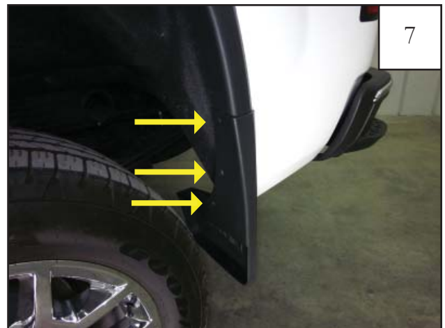
FOR MODELS WITH FACTORY MUDFLAP: Use a Phillips Head Screwdriver to remove 3 factory mud flap fasteners.