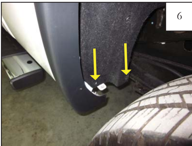
Re-install two factory screws into wheel well liner.