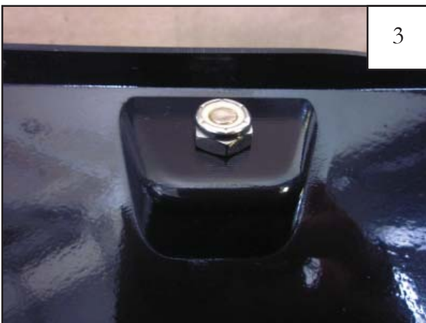
Place a Nut (NU1-0019) over the end of each Bolt and tighten, using a 1/2" wrench for the Nut and the supplied Torx Bit (SW1-0052) for the Bolt. Repeat for remaining pockets.