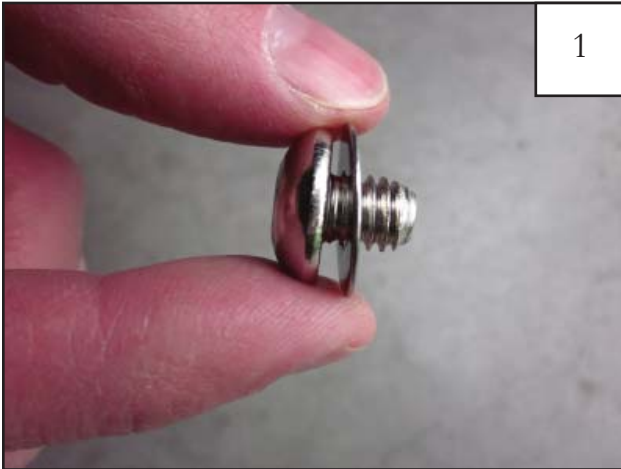
Put a Washer (WA1-0012) on each Bolt (SW1-0059).