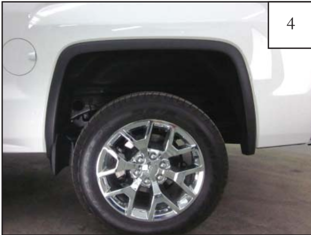
Factory wheel arch molding must be removed prior to part installation. See next steps.