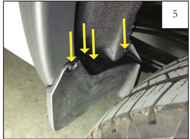
Using a T-15 Torx bit, remove the 4 factory screws from the plastic wheel well piece and remove.