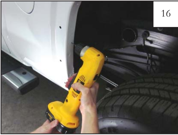
Using a 3/32" drill bit, drill pilot holes through sheet metal at the marks made in Step 34.