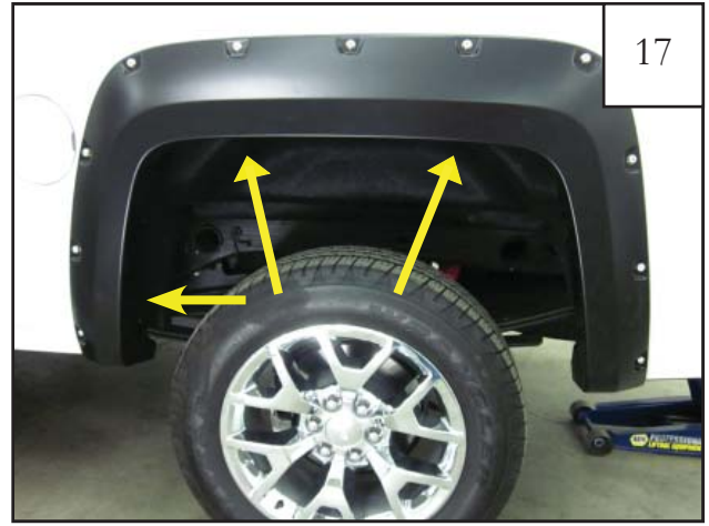
While holding flare on vehicle, install supplied screws (SW1-0056) into the 2 upper and 1 lower factory hole locations. Do not fully tighten at this time.