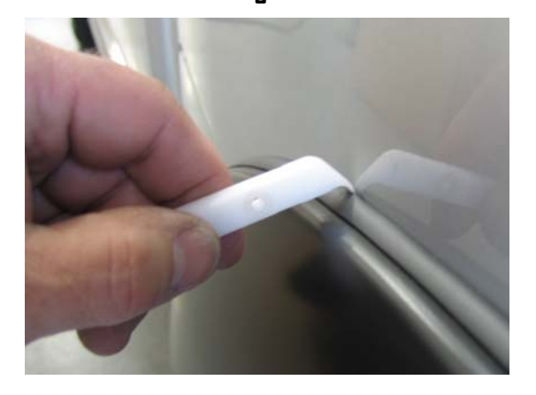
Illustration #4 Curved Edge Trim Tool