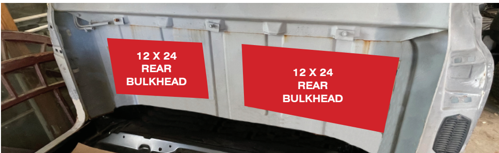
FIG. 3 Rear Bulkhead Install damping material in these approximate locations. The perfect placement is not critical. But good adhesion is key. Make sure to press material in place with roller to ensure good adhesion. (View from driver side door)

NOTE: We have provided extra Boom Mat Tape that can be used in other areas or in your doors as needed.