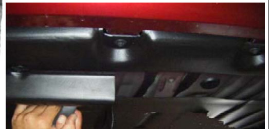
UNDERBODY TRIM DIAGRAM 2