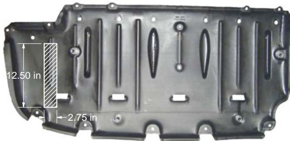
UNDERBODY TRIM DIAGRAM 1